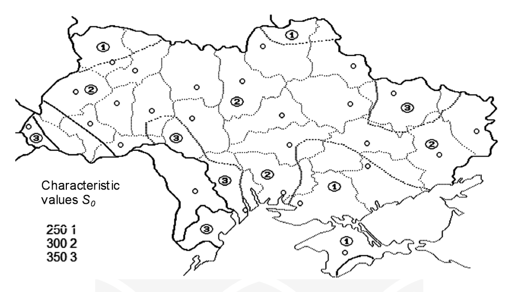
Fig. 3. The Ukraine territorial districting of the snow loading on cold roofs