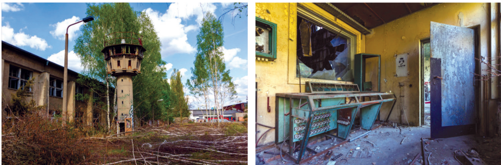
Fig. 1. Former airfield in Johannisthal. The place is a subject of interest of photographers and graffiti artists

During the First World War the airport in Johannisthal was used by military and for aircraft production. In 1912 the German Experimental Institute (DVL-Deutsche Versuchsanstalt für Luftfahrt) was established and the airport became an important place where research was conducted. 1919 was very significant for the airport history too, because then the Deutsche Luft-Reederei (German airline, Lufthansa’s predecessor) began its first post and passenger flights there. Passenger traffic was moved from Johannisthal to Berlin when the new airport