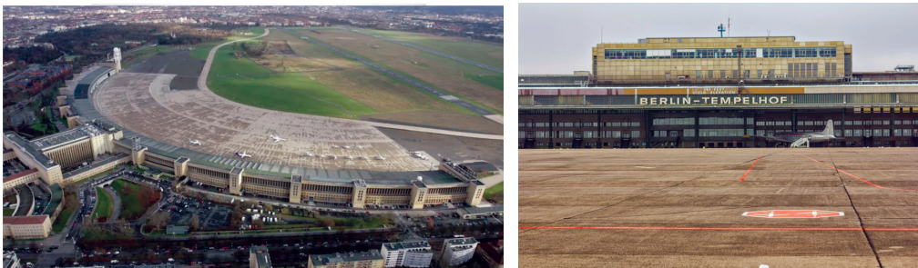
Fig. 3. Berlin-Tempelhof Airport a bird's-eye view and facade of the terminal (source: [37, 38] accessed: 26.02.2019)

In 2009 a competition for the adaptation of Berlin-Tempelhof airport, whose terminal building has been protected from 1995, was announced. The former airport became the subject of many works. Although the projects differ a lot, a linking element in these conceptions could