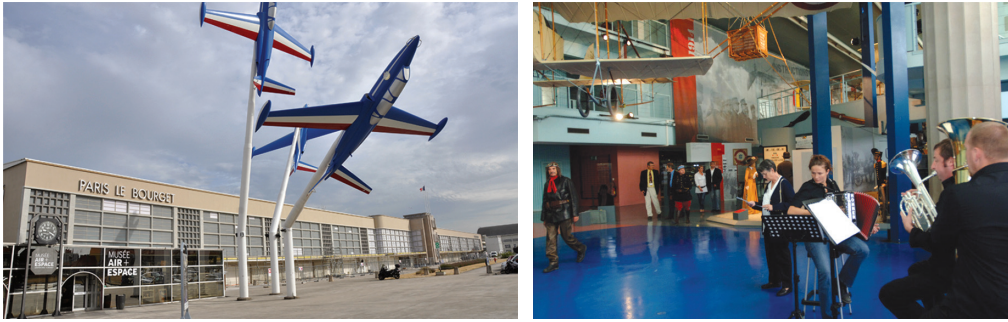
Fig. 4. Air and Space Museum in Paris (source: [39, 40] accessed: 26.02.2019)