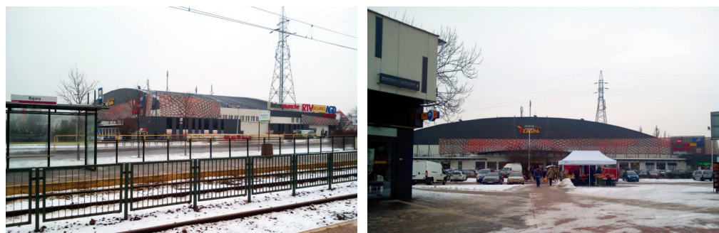
Fig. 2. An old hangar in Gdańsk-Zaspa, 2019

The area of the former Gdańsk-Wrzeszcz Airport was absorbed by a new housing estate, and that district was named "Zaspa", which is still in use. Of the former infrastructure, the remnants of the runway and one of the hangars could be seen. The hangar was adapted into a shopping centre, the other two hangars were demolished, and the area has been allocated