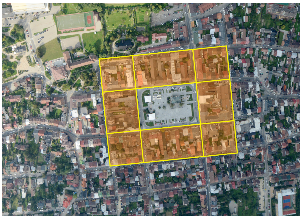
Fig. 1. A recent orthophotomap of Nowy Targ. The yellow colour indicates the urban model upon which the town was founded. Photo: W. Gorgolewski, 2017; prep. by the authors

Surprisingly, the urban layout of Nowy Targ described above is not included in the voivodship monument register. Therefore, it is vital that the town gains a binding LSDP [10], containing regulations to protect the historic downtown and its urban layout [11].