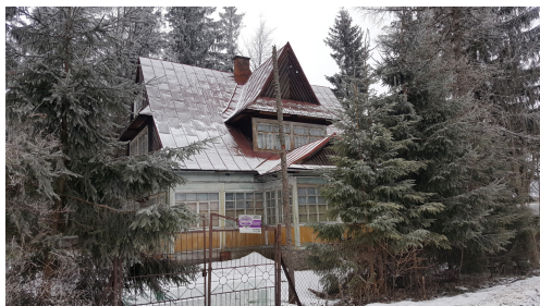
Fig. 9. House at 16 Tuwima St.