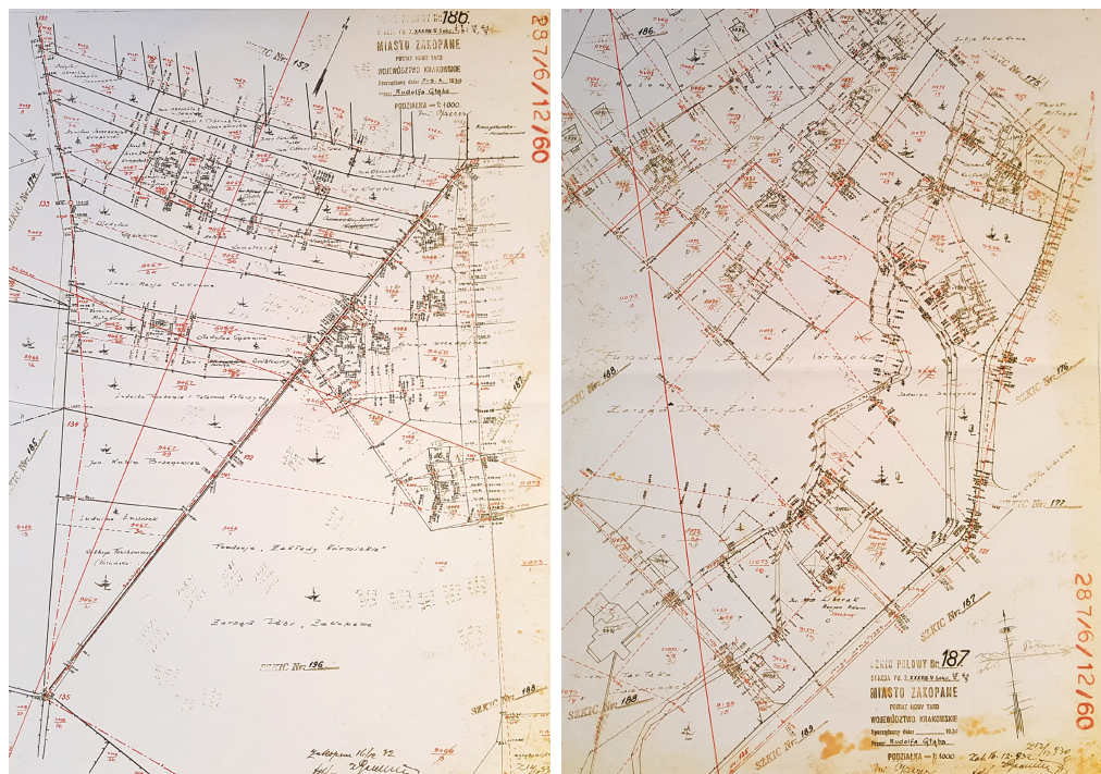
Fig. 4. a, b. Copy of original sketches (no 186 and 187) concerning "Clerks' Parcels"