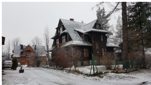
Fig. 8. House at 12 Tuwima St.

Unfortunately, those valuable objects are usually in poor technical condition. This is related to the fact that some of them have been renovated (insulated, plastered, painted) in a very unprofessional way. Yet they have still preserved their original size, proportions and character, even though several decades have passed. Also, the cultural landscape of the place has been preserved, which constitutes a considerable value.