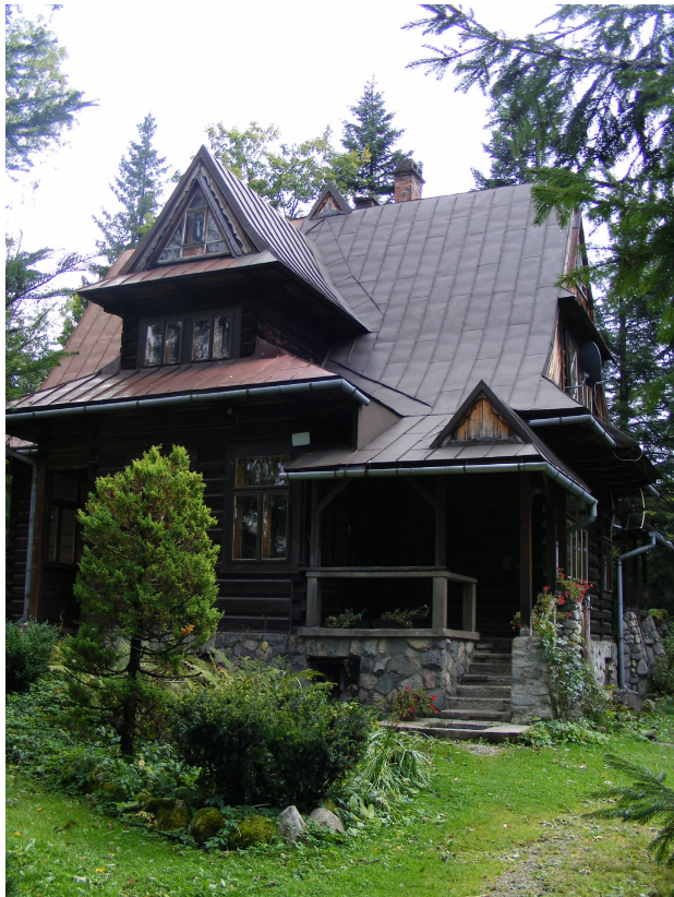
Fig. 7. "Irmik" villa at 5 Zwierzyniecka St. in Zakopane