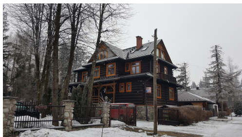
Fig. 12. House at 11 Zwierzyniecka St. (photo by authors, 2018)