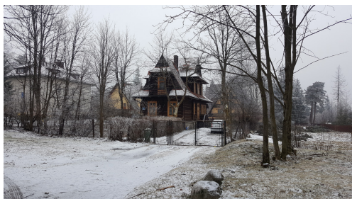
Fig. 13. House at 4 Szymanowskiego St.