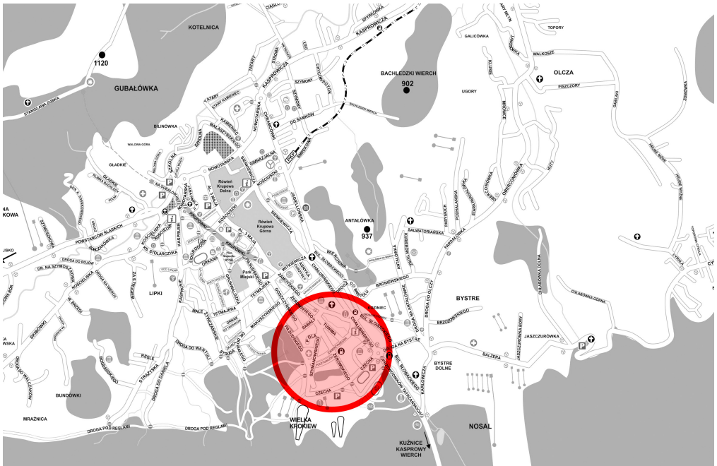
Fig. 1. Map of Zakopane with marked location of the Clerks' Parcels. Prep. by Authors using the map of Zakopane from the Archive of the Zakopane Cultural Centre (source: [11])