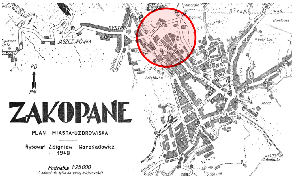
Fig. 3. Fragment of the map of Zakopane from 1948. The area of the Clerks' Parcels is marked on the map