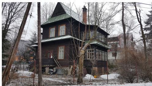
Fig. 10. House at 20 Żeromskiego St.