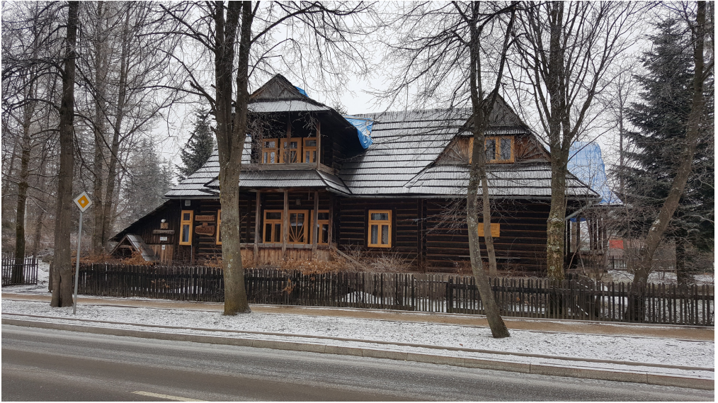
Fig. 6. "Koszysta" villa at 69 Piłsudskiego St. in Zakopane (photo by authors, 2018)