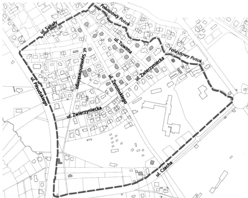
Fig. 2. Site plan of the Clerks' Parcels in Zakopane. Current state