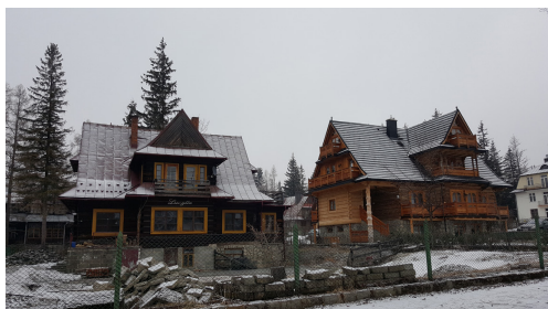
Fig. 11. Houses at 33 and 35 Żeromskiego St.