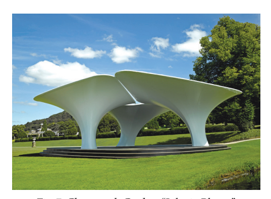
Fig. 7. Chatsworth Garden, "Lilas in Bloom" Zaha Hadid, [11]

The vast green interiors, the shape of the terrain around the palace, as well as numerous water artefacts make the exhibition of the works that are presented here exceptionally spectacular. This effect is additionally heightened by contrast. During the aforementioned exhibition, against the backdrop of this historical garden, works such as Tony Cragg's "Declination", Zaha Hadid's "Lilas in Bloom" or "Hoop-La" by Alice Aycock were presented.