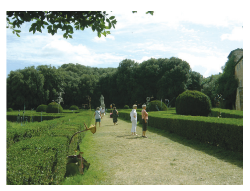
Fig. 8. San Quirico d'Orcia, Itay, Temporary exhibition in Horti Leonini