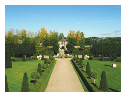
Fig. 6. Kilmainham Hospital and Garden, Dublin, the fountain "North South East West" (photo by K. Łakomy, 2012)