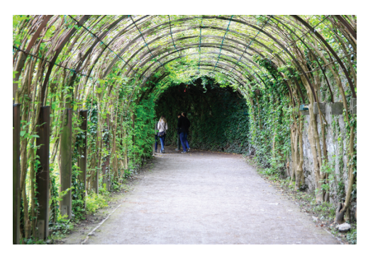
Fig. 1. Mirabell Palce and Garden, Salzburg, classic pergola

Art, the art of garden design and the art of the landscape are subjects which have been intertwined since the dawn of history. The landscape, the garden, landscape and garden interiors can constitute a work of art, house other works of art and can be an inspiration for the visual arts (Fig. 1, 2), finally, they can become a scenography, a background for the presentation of these works. The fine arts can round out a work of landscape architecture and garden design, they can create new effects and values. Finally, works of art can be made in order to transform an existing convention and form of a park or a garden (flower and garden exhibition, as well as land art are a separate issue).