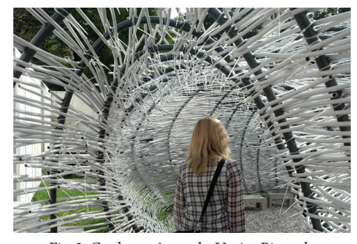
Fig. 2. Garden at Arsenale, Venice Biennale of Architecture 2014, pergola as a work of art