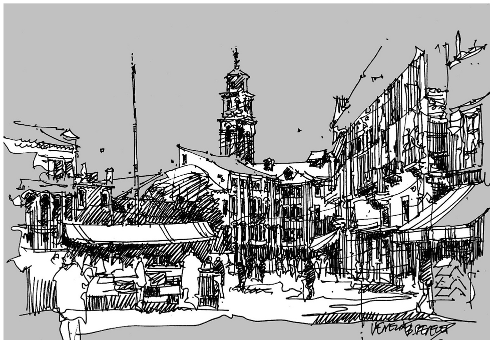
III. 2. Venice – marketplace (drawn by Beata Malinowska-Petelencz)