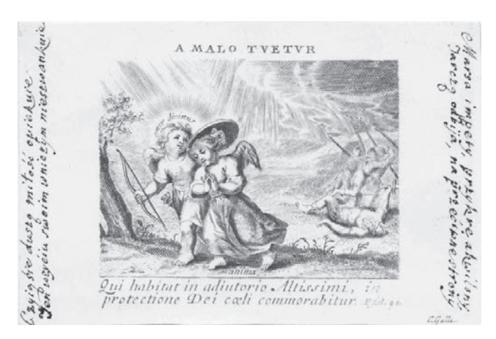
Fig. 5. A Polish subscriptio to copperplate by C. Galle (copy of illustration of emblem 21 A malo tuetur from Amoris divini emblemata by Otto van Veen). Ethnographic Museum in Cracow, inventory no. 44814