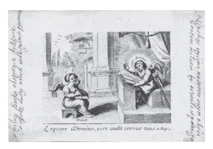
Fig. 4. A Polish subscriptio to a copperplate by C. Galle (copy of illustration of emblem 8 Amor docet from Amoris divini emblemata by Otto van Veen). Ethnographic Museum in Cracow, inventory no. 44813