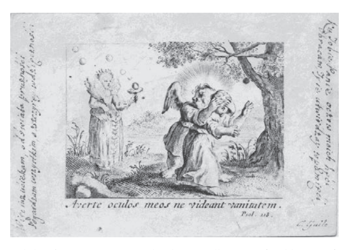
Fig. 3. A Polish subscriptio to a copperplate by C. Galle (copy of emblem II 5 from Pia desideria by Herman Hugo). Ethnographic Museum in Cracow, inventory no. 44816

an ejaculation, perfectly corresponding to the original context of the emblem, presented in the second part of Hugo's cycle, devoted to the desires of the Sanctified Soul, no longer sensitive to the temptations of the world. If, taking into account the provenance of the prints, an unknown male or female author of the four-line poems is placed in a monastic environment, the break with the World described here gains additional meaning.