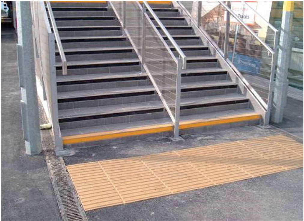
Fig. 3. Corduroy surface (source: www.tactilesurface.co.uk , accessed 10.03.2018)