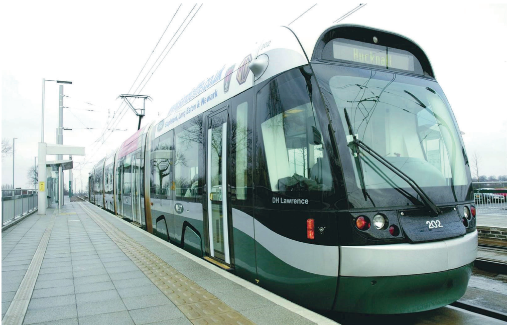
Fig. 4. Platform edge warning surface on a tram stop