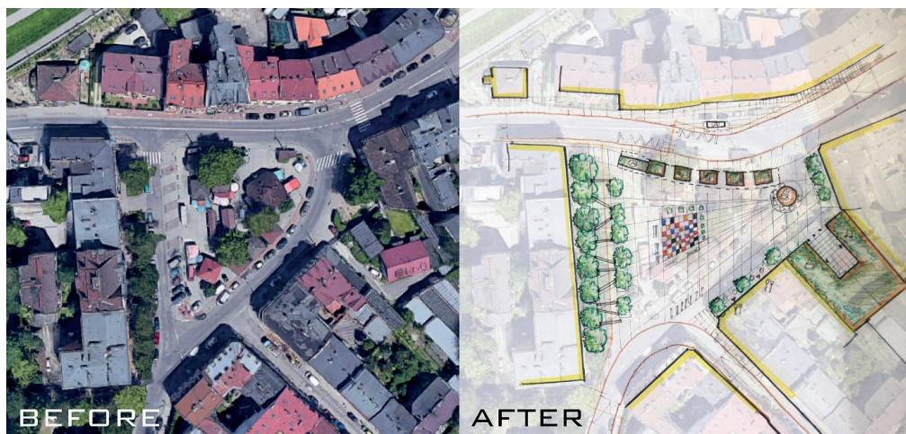
Fig. 10. The Let's make noise – design concept developed as a part of the Przepis na miasto workshop. Prepared by Jakub Salach, Małgorzata Stec, Maciej Pilny, Justyna Mazur, Natalia Kobza

The project which adapts Stare Dębniki area to the mobility needs of sight-impaired people is the Let's make noise 6 conceptual design (Figs. 10, 11). In this solution, the authors focused on Rynek Dębnicki square, the most difficult area to overcome by sight-impaired people. The concept assumed the revitalization of the public space. In this proposal, the removal of road lanes around Rynek Dębnicki square was intended to improve pedestrian safety. A reduction in private traffic would permit a friendly public space to be created. The authors proposed widening the sidewalks, introducing trees near buildings, changing the surfaces of pavements according to the needs of sight-impaired people, and improving free-standing small shops and street lighting. The concept assumed the revitalization of the municipal greenery and the introduction of a green pergola on the western side of Rynek Dębnicki square. The greenery would protect space users from the sun. The authors proposed residential and non-residential land use, and small facilities on the ground floors of surrounding buildings. In the central part of Rynek Dębnicki