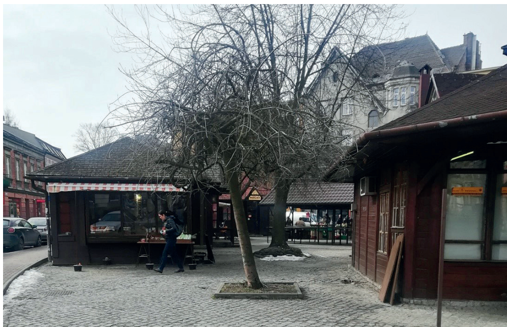
Fig. 5. Rynek Dębnicki – main square of Stare Dębniki.

Dębniki is one of eighteen districts of Cracow, located in the southwest part of the city. The district's area is 46.19 square kilometers. Stare Dębniki is the northern part of Dębniki district and is delimited by Generała Bohdana Zielińskiego street, Monte Cassino street and Vistula River (between Zwierzyniecki and Grunwaldzki bridges). The primary land use of Stare Dębniki is residential housing (a mix of single and multi-family housing). Characteristic points of Stare Dębniki are Rynek Dębnicki, Saint Stanisław Kostka Church and Dębnicki park. Rynek Dębnicki (Fig. 5.) is the main square of Stare Dębniki and has the shape of an irregular quadrilateral. There are several schools in Stare Dębniki: the Primary School with Integration Units No. 30 1 , the Secondary School of Integrating No. 3 2 and the Special School and Educational Center for Blind and Visually Impaired Children 3 . The latter was established in 1948. It is an important center of education, counseling and rehabilitation of a wide age range of children and youth with sight dysfunction.