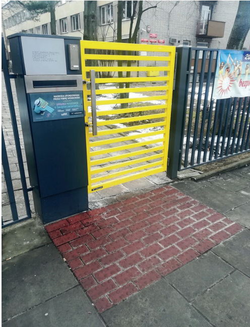
Fig. 6. School entrance gate.