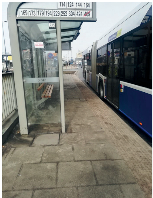
Fig. 9. Konopnickiej bus stop – platform edge warning surface. Photo by Ewelina Stypulkowska (2018)