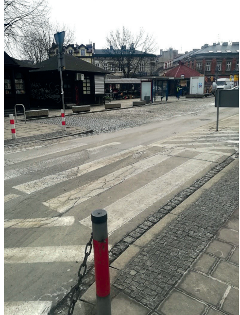
Fig. 7. Rynek Dębnicki square – pedestrian crossing and bus stop.