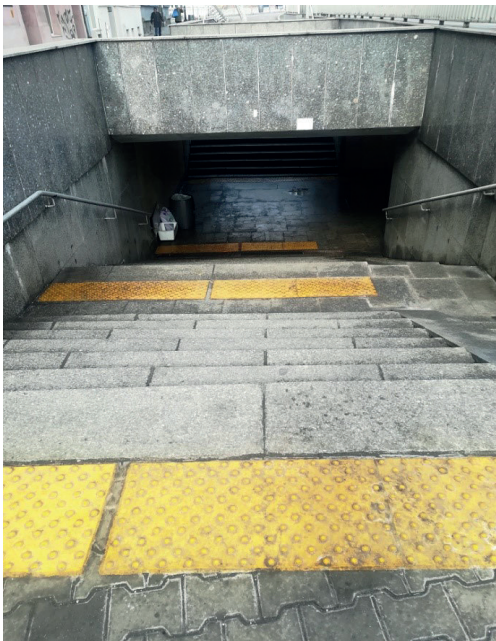
Fig. 8. Marii Konopnickiej street – underground passage.