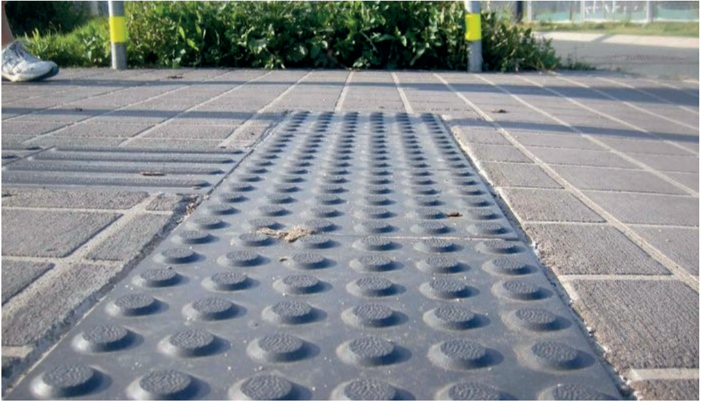
Fig. 1. Tactile paving