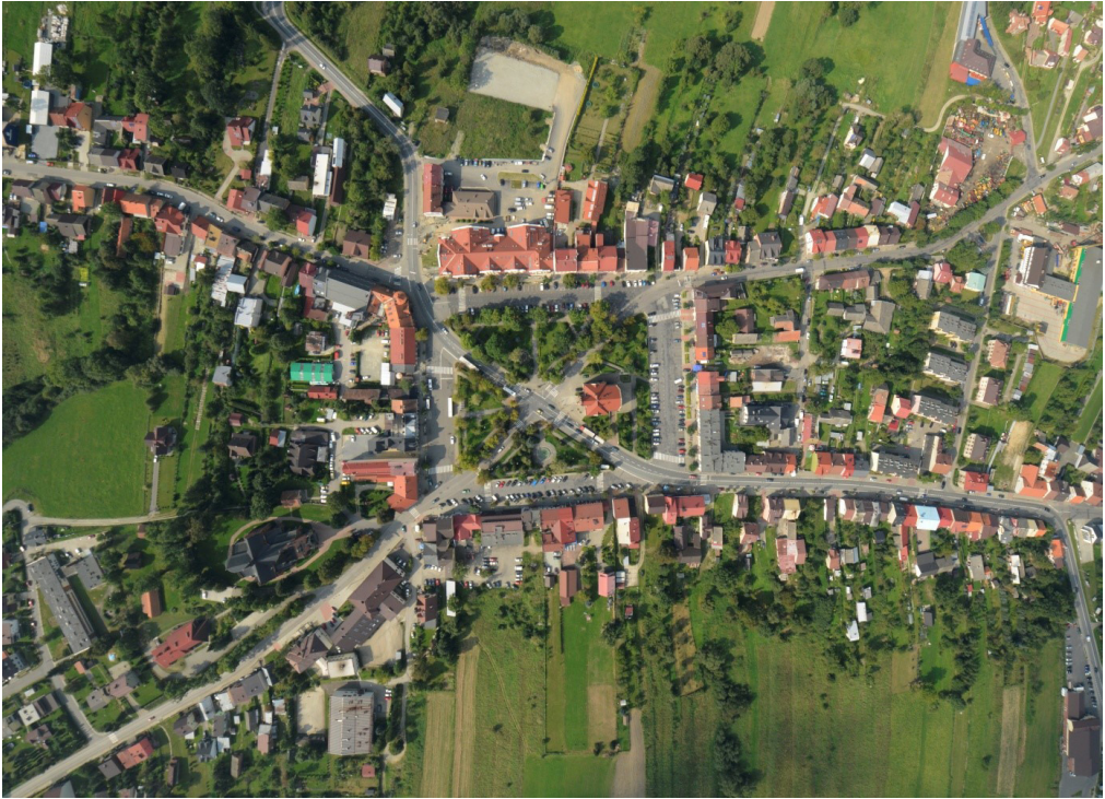
Fig. 5. Jordanów on a contemporary orthophotomap