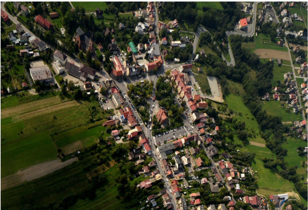
Fig. 1. Jordanów on a contemporary aerial photograph, view from the south-west (Photo by W. Gorgolewski, 2017)

Economic centres in the Land of Krakow were essentially founded between the sixteenth and the eighteenth century. These were economic centres of territorial units (village complexes, called klucze in Polish sources), fulfilling trade-related functions associated with the exchange of goods, including the selling of craft products. These economic centres differed in size and their functional and spatial programme, as well as their role and significance within their respective regions, which led to their division into simple and complex layouts. Complex layouts were characterised by relatively small areas and were primarily associated with local trade. The complex layouts, in turn, were larger towns or cities, which, apart from a trade-related form of use, also featured other functions which were not necessarily linked with