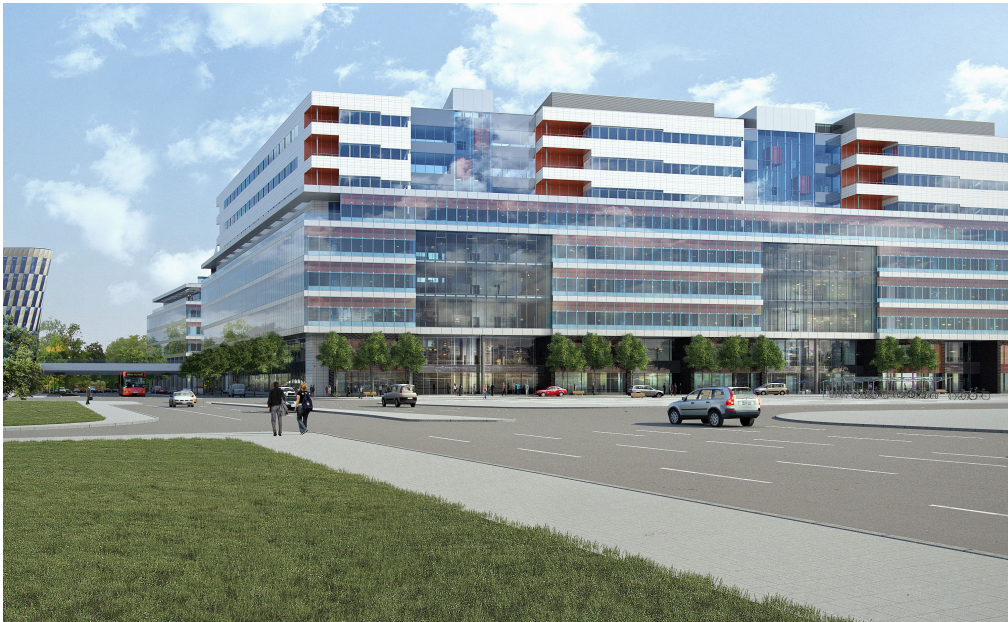
Fig. 1. Visualisation of NKS Hospital building.

guidelines were taken into account from the earliest stages of the project and decision-making processes in the following areas: energy-efficiency, minimisation of the environmental impact of the project, environmental certification by an independent entity, balanced materials and waste management, provision for high quality microclimate inside the buildings.