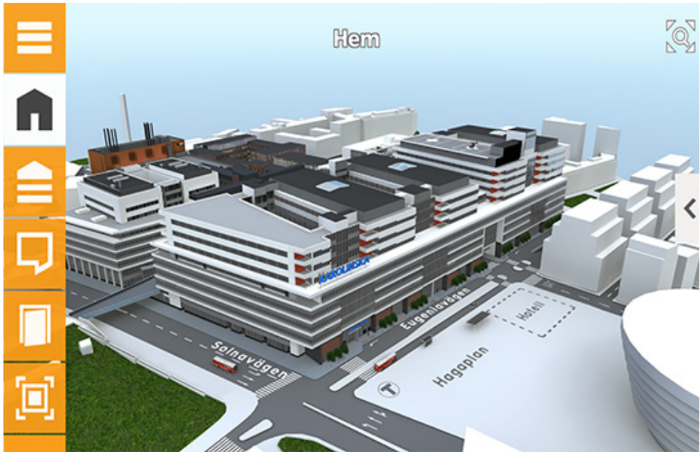
Fig. 2. NKS Mobile Application Screen.

Another example of an interesting FM-related solution is a system called JiT cabinets, designed to supply the hospital with medical materials and accessories. The system was designed together with the future users of the building and the supplier of FM software and hardware for new NKS buildings. The JiT cabinets for equipment and materials are located in niches at several places on every floor close to the main corridors. The cabinets are the final link in an automated chain that leads to the user, such as staff in an operating theatre. The contents are readily visible and easily accessible. Material supply to the cabinets takes place mainly using robots that control trucks loaded with textiles or sterile goods to and from the units. Virtually all transport takes place using these robot trucks, automated guided vehicles (AGV), which have their own lifts and will carry out around 1600 transports per day. Since the operation planning system can talk with the sterile unit's IT systems, everything will be in place when it is needed. The chain includes sterilisation, material supply and the so-called value-added process that consists of the AGVs and the JiT stores.