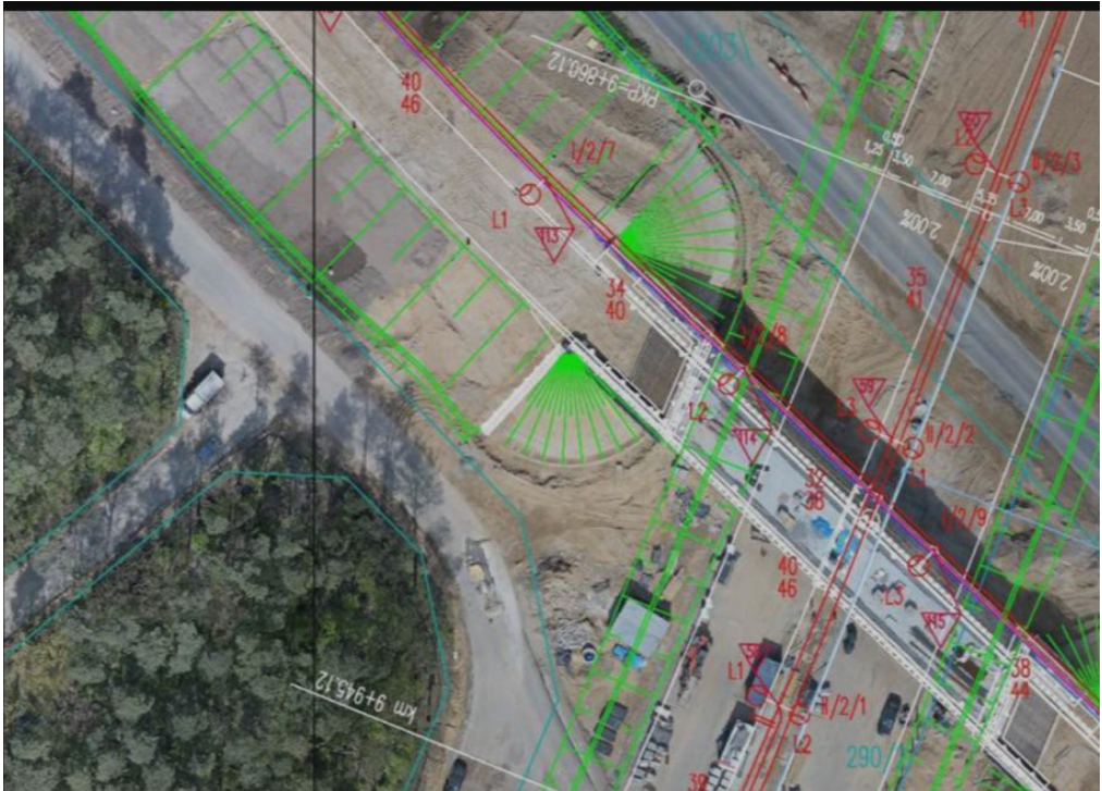
Fig. 3. Digital verification of the state of work.

and 2 more days for data processing. The data acquired using traditional methods is relatively light (approx. 100 MB) which limits the detail level of the performed inventory. Inventory of the same piece of roadwork using digital technology, which produces orthophotogrammetric images, requires 1 day for the flights and 3 days of data processing. The obtained spatial data set is large (12 GB) and provides a very detailed image of the work progress.