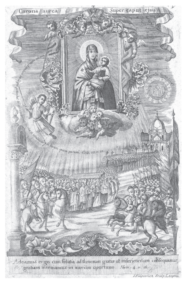
Fig. 2. A march with military assistance in the foreground heading for the crowned image of Holy Mary of Berdyczów, Ozdoba i obrona ukraińskich krajów . . . watykańskimi koronami . . . ukoronowana . . . , part 2, Berdyczów 1767, f. tit. v. Jagiellonian Library 58895 Mag. St. Dr.