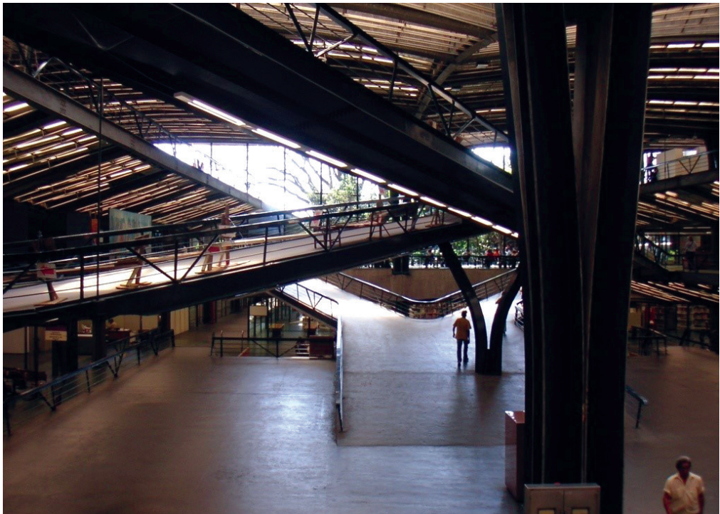
Fig. 4. Centro Cultural de São Paulo (CCSP), Eurico Prado Lopes and Luiz Benedito de Castro Telles, 1976