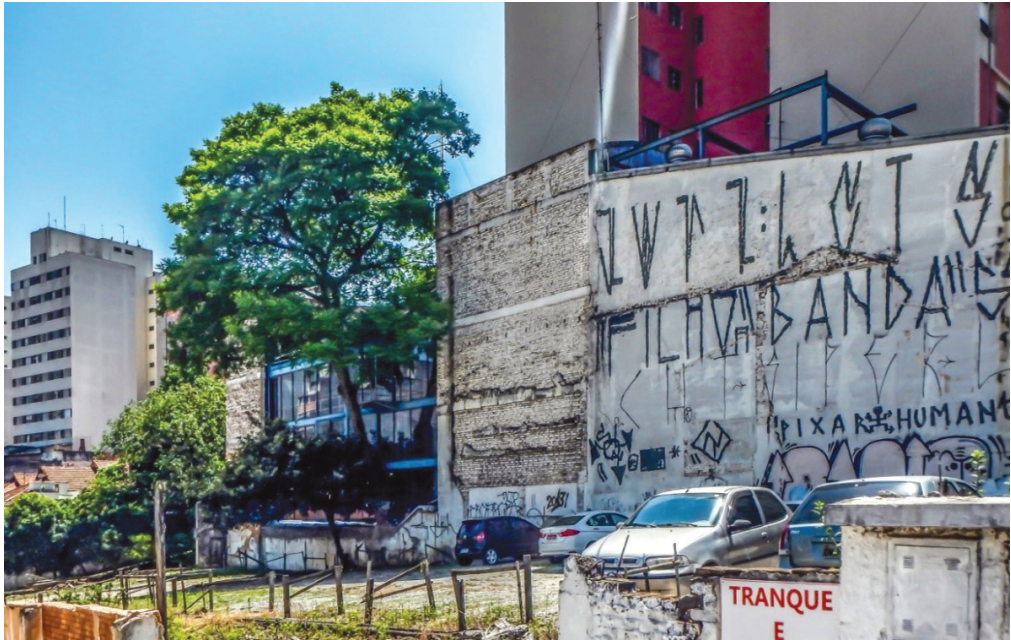
Fig. 3. Teatro Oficina, São Paulo, Brazil, L. Bo Bardi, E. Elito, J.M. Corrêa, 1980–84