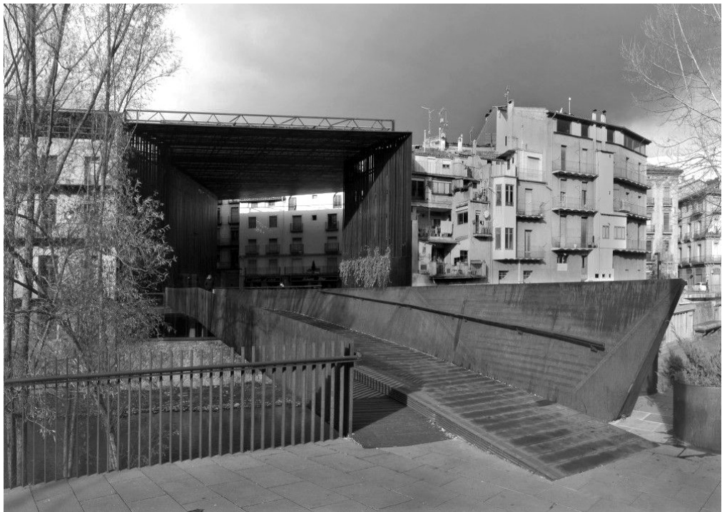
Fig. 5. Teatro La Lira, Ripoll, Spain, 2011, RCR Arquitectes