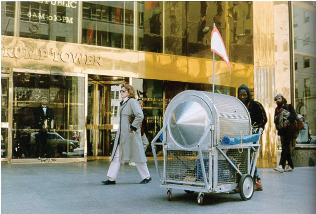
Fig. 1. Krzysztof Wodiczko, The Homeless Vehicle, 1988–1989, 5 th Avenue New York 1988, www.culture.pl