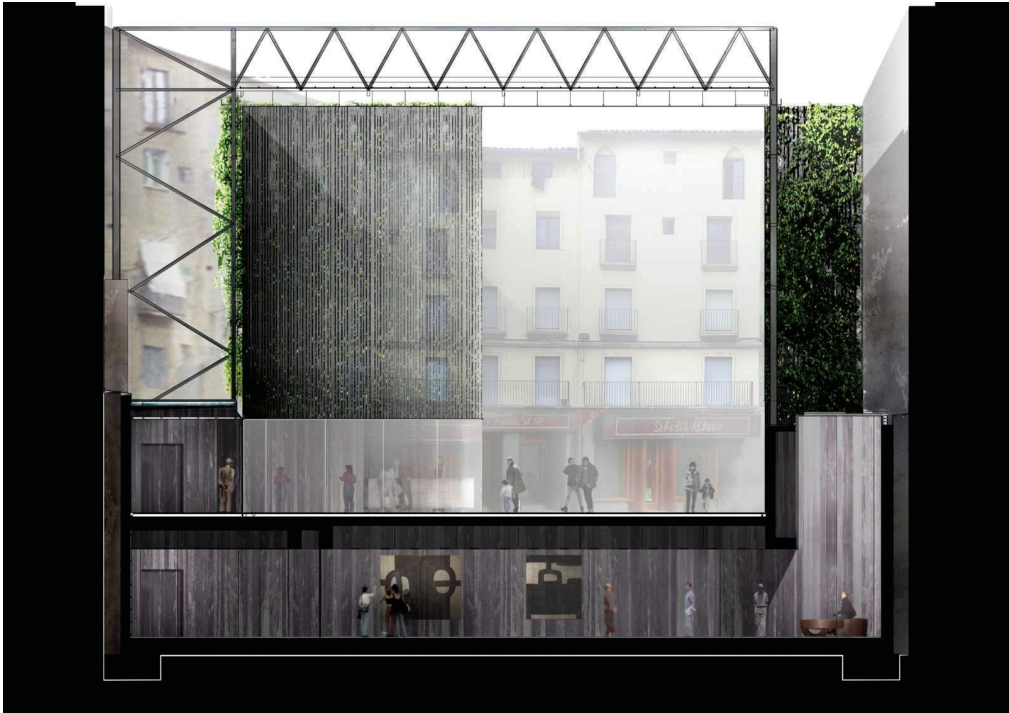
Fig. 6. Teatro La Lira, Ripoll, Spain, 2011, RCR Arquitectes (competition drawing)