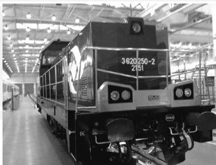
Fig. 10. The diesel engine of 6Dg/B type

The diesel locomotive of 6Dg/B type (Fig. 10) is an example of a complete upgrading of the shunting diesel locomotive SM42. The scope of upgrading included, but was not limited to: a change of the locomotive's external appearance; improvement of engine driver work ergonomics; replacement of the driving unit. The retrofitted locomotive still has the same traction system, which employs 1LN bogies.