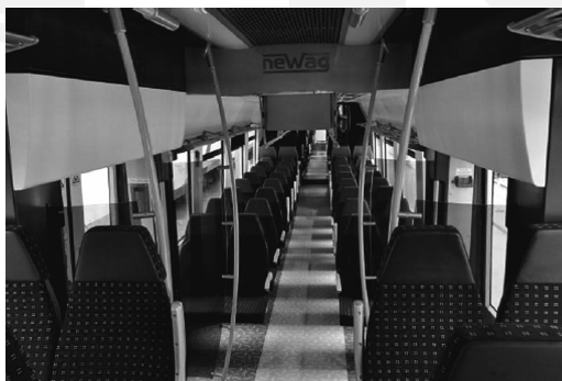
Fig. 9. Passenger compartment of Diesel Multiple Units

To enable boarding and deboarding for the disabled, the DMUs have been equipped with lifts.