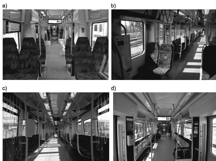
Fig. 7. Examples of interiors of Electric Multiple Units

The fittings of both EMUs and the engine driver's cabin are pretty much the same. Differences may occur due to EMU customization for specific users. Figure 7 shows samples of interior layouts of 19WE, 35WE and 31WE Electric Multiple Units. Figure 7a shows a view of the compartment with double mounted seats, whereas Figure 7b shows a train unit with a ticket machine installed, Figure 7c shows a compartment with seats mounted according to the “metro” spatial layout, whereas Figure 7d shows a compartment with seats for the disabled.