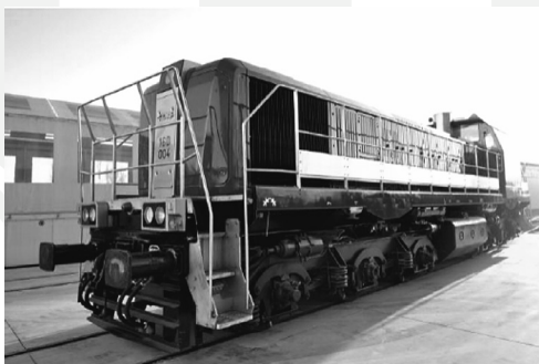
Fig. 12. 15D/16D diesel locomotives

During the modernisation the project, the height of engine rooms was reduced, which greatly improved visibility from the engine driver's cabin.