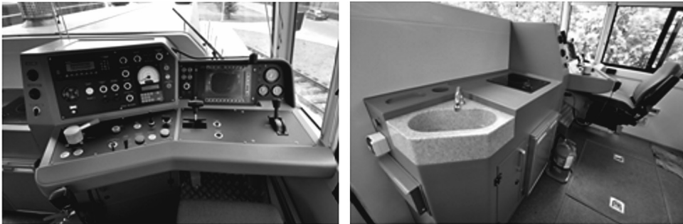
Fig. 11. Engine driver's cabin in the locomotive 6Dg/B

During the modernisation process, a brand new design for the engine driver's cabin was developed (Fig. 11). The cabin width was enhanced. The side walls were equipped with modern sliding plug windows with internally bonded window panes. The windshields were also constructed using internal bonding technology, and the panes are equipped with an electric heating system with a total power of 770 W [8].