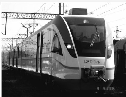
Fig. 1. 14WE Electric Multiple Unit (EMU)

From the original electric multiple unit, only the bogie frame, frame elements and bogies were kept and were subjected to a major overhaul. The retrofitted vehicles were adapted for handling suburban commuter traffic. To enhance operational comfort, the traction system was retrofitted in accordance with documentation drawn up by the 'ROLLING STOCK' Rail Vehicle Institute. The traction system consists of two bogies: 36AN rolling bogie and 23MN motor bogie. The modernisation process involved the changing of the method of springing wheel sets. The multiple plate springs and leaf springs were replaced with cone springs as well as metal and rubber springs, which improved travelling comfort to a large extent. At the same time, the wheel set driving was changed by means of the introduction of a new type of axle-boxes with bearings marked NJ + NJP 130 [1].