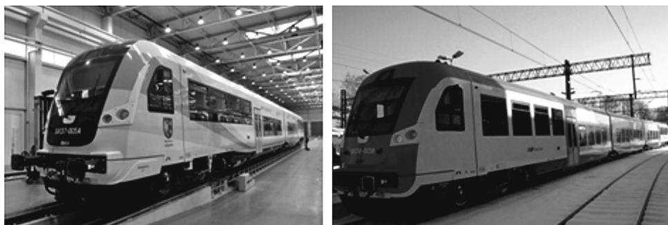
Fig. 8. 220M and 221 M Diesel Multiple Unit (DMU)

Both DMUs may be operated at a maximum speed of 120 km/h.