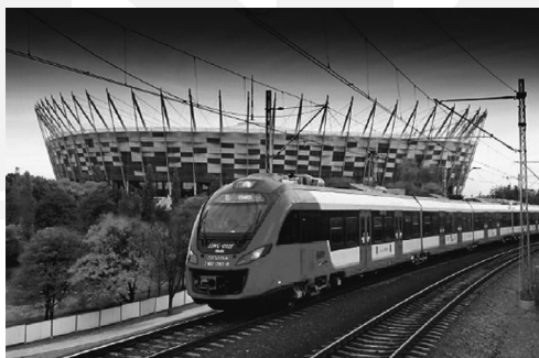
Fig. 5. 35WE Electric Multiple Unit (EMU)

The second newly built Electric Multiple Unit is 35WE called "Impulse" (Fig. 5). The 35WE Electric Multiple Unit has been designed for handling high density local traffic. The train consists of six cars with the following arrangement: "s+d+s+s+d+s" (motor car + trailer car + motor car + motor car + trailer car + motor car). The 35WE Electric Multiple Unit, like the previous EMU, has been designed to travel at a maximum speed of 160 km/h. The Electric Multiple Unit has been designed to carry the disabled. The disabled wheelchair passengers may access the train through platforms mounted on both sides of terminal units.