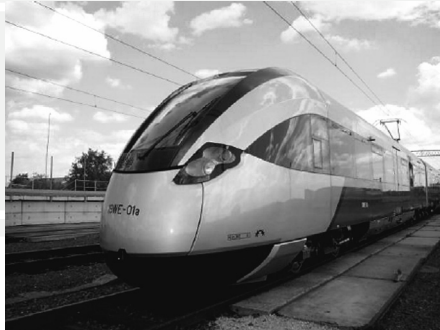
Fig. 4. 19WE Electric Multiple Unit (EMU)

Initially, the 19WE Electric Multiple Units were designed to go to a maximum speed of 130 km/h. Now these vehicles can be operated at a speed of 160 km/h. Because of the interior layout, the EMU has been designed to handle local high density passenger traffic. The basic arrangement of the EMU is “s+d+d+s” (motor car + trailer car + trailer car + motor car). In case of high traffic density, the EMU can be operated using multiple traction. In order to perform the fast coupling of units, automatic self-acting couplers made by Voith were applied.