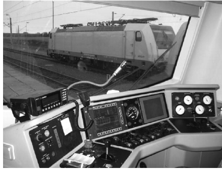
Fig. 3. A view of the console in EN57 and EN71 Electric Multiple Units

In the retrofitted EMUs, the same bogies were installed as in the 14WE train sets. To propel EMUs, asynchronous motors were applied and thus the combined driving system was created together with a two-shift final drive.