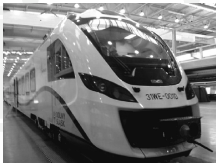
Fig. 6. 31WE Electric Multiple Unit (EMU)

The train consists of four units in the Bo2'2'2'Bo configuration (motor car + trailer car + trailer car + motor car).