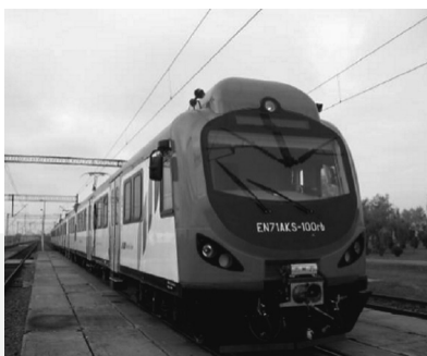
Fig. 2. EN71 Electric Multiple Unit (EMU) with modernized front

The scope of other modernisation projects of the EN57 and EN71 electric multiple units (EMUs) comprises mainly the change of external appearance, enhancement of travelling comfort through improvement of the EMU interior and installation of equipment enabling the disabled to use the trains. An example of such a retrofitted Electric Multiple Unit (EMU) is presented in Figure 2.