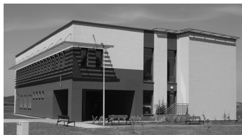
Fig. 1. The passive school building in Budzow

The first passive school building was erected in Bremen-Sebaldsbruck (Germany) in 2001. Eleven years later, a similar structure – characterized by great energy savings – was built in Poland. This school, located in Budzów (Lower Silesia), is heated with the special devices using the energy produced by students as well.