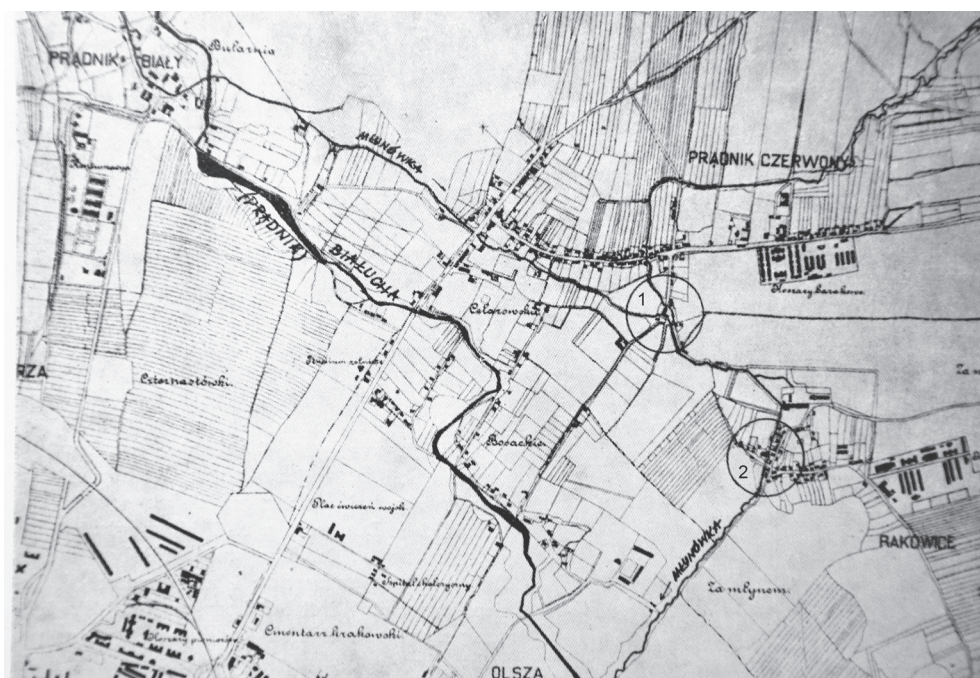
III. 2. Fragment of the Greater Kraków Plan from 1910. One can see rivers Prądnik (Białucha) and Olszecka Leat, and buildings “Dominican Mill” (“Frog Mill”) and “Rakowicki Mill”: 1 – “Dominican Mill” (“Frog Mill”), 2 – Rakowicki Mill (prepared by the author)

Prądnik from the area of the weir in Bularnia, having previously moved the wheels of the Frog Mill owned by the Dominicans. “... Following the example of the Rudawka, a leat, called the Olszecka leat, had been built for the mill near the royal village of Rakowice, upon which several mills were built owned by monasteries which had their land there ...” 15 . The wooden building of the Rakowicki mill, which had not been destroyed at the time of the Swedish invasions, was replaced by a brick facility in the 70s of the 18 th century, this facility performed its function incessantly until 1946 (III. 2).