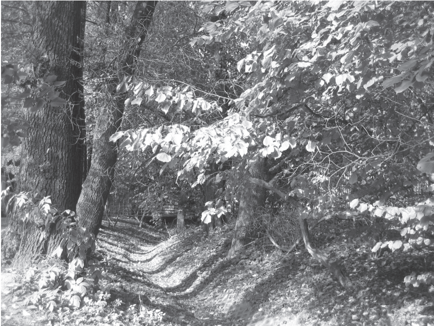
III. 4. Water-less Olszecka Leat bed between the Polsad Roundabout and Młyńska Boczna Street