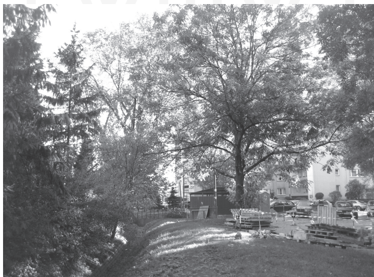
Ill. 5. The Rakowicki Mill used to stand in the place of the present car park and block of flats visible in the background until 1978. On the left, the water-less bed of the Olszecka Leat

In the area of the village of Rakowice, there is the still discernible bed of the Olszańska leat. The Rakowicki Mill does not exist any longer. In the place of the mill’s building, a housing tower was built at the end of the 70s, a car park and a green plaza have been put up (Ill. 5). The existence of a royal mill in this place is commemorated in the names of the streets: Młyńska (Mill street), Młyńska Boczna (Mill Side street), Żarnowa (Hand mill) or Sadzawki (Pool).