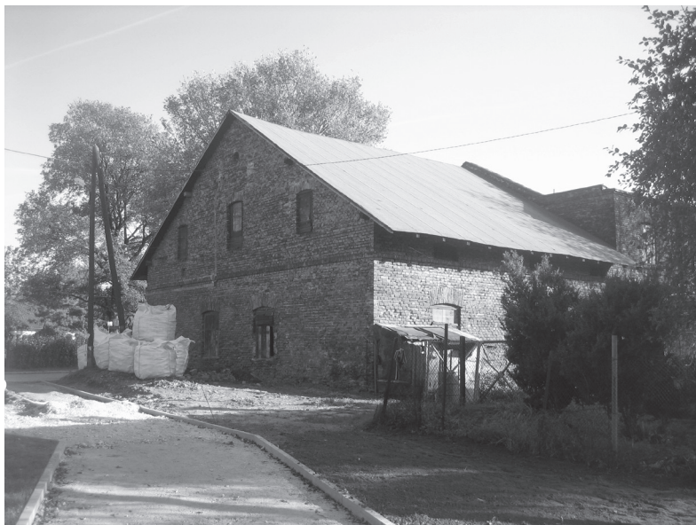
Ill. 1. The Dominican Mill ( Frog Mill )

The boundaries of the present-day 3 rd district of Kraków also encompass a part of the area that used to belong to the village of Rakowice. The first mention of this village, which until the end of the 1 st Republic was a royal village, comes from 1244. In the 15 th century, a farm, a royal manor and a mill called the Rakowicki Mill were established. The whole complex is still clearly discernible on a map from 1944. In the 19 th century, the manufacture of chicory was founded in the area of the farm, which at that time was the property of Antoni Zazmanit 10 . In 1910, the area of the farm was bought by the Piarists 11 , who built a chapel and an Education Institution for boys. In 1912, an airport started to operate in the area of Rakowice which was gradually extended in the following years – it was the biggest and the most modern in Poland at that time 12 .