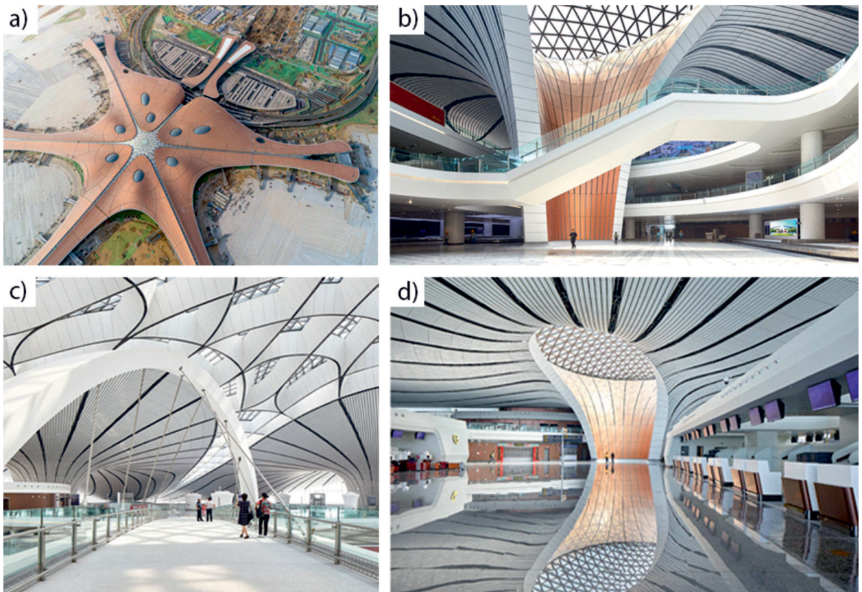
Ill. 1. Beijing Daxing International Airport (arch. «Zaha Hadid Architects», Daxing, Beijing & Guangyang, Langfang (Hebei), 2019): (a) – aerial view of the airport building; (b–d) – interiors airports complex structure

The Solidarity Museum in Gdansk, which is dedicated to the history of the Polish «Solidarity» movement (Fig. 3), is the embodiment of the principles of contemporary interior design as well. The space of the center is an example of a modern museum that engages in dialogue with visitors. The interior of the museum includes: exhibition halls, offices, a spacious central courtyard that cuts the building in half. The interior of the center is decorated in an industrial style. The exhibition halls are filled with historical exhibits, original documents and newsreels, as well as large-format spatial installations