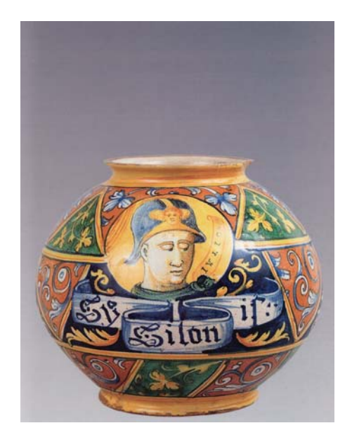
Fig. III. Examples of apothecary's maiolica jars with the motif of the head of a man in a helmet.

The bottom of the jar bears a trademark consisting of three bells, identifying its origin as a potter's workshop which operated in Delft (Holland) in the seventeenth and eighteenth century<sup>4</sup>.