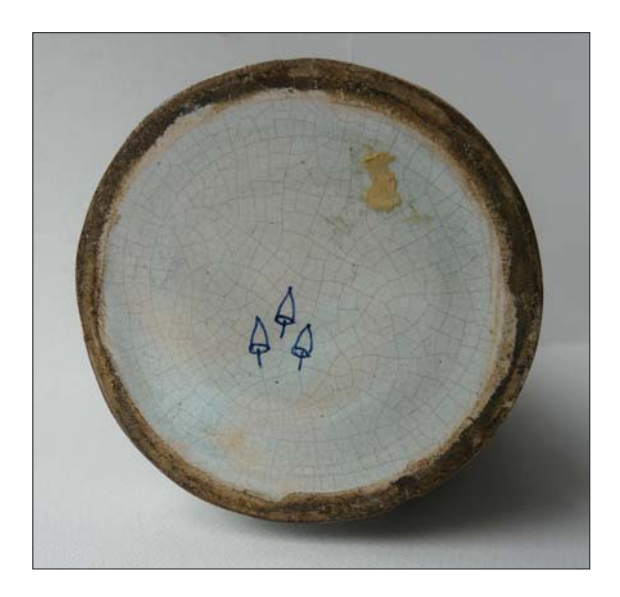
Fig. IV. The bottom of the jar – the trademark of the workshop.

Kermes is a scarlet-coloured natural substance obtained from impregnated female Coccus ilicis insects, which feed on the kermes oak (Lat. Quercus coccifera – see fig. V). These roundish smooth-bodied organisms, which grow to be as big as peas, were long thought to be plants – it was not until the beginning of the 18<sup>th</sup> century that they were discovered to be insects. In antiquity, a preparation of kermes "grains" ground with vinegar was applied externally: for example Dioscorides (1<sup>st</sup> century AD) recommended the medicine as one that makes wounds and other injuries of the body heal fast. Arabic medicine (8<sup>th</sup> to 13<sup>th</sup> century) would also apply kermes internally, as an ingredient of the very confection called alkermes which was considered to be cardiac and administered mostly to relieve palpitations. It was also used as a tonic and, less often, in the treatment of smallpox and measles.