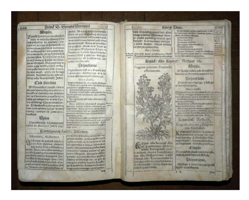
Fig. IX. Pages 1344 and 1345 of Serenius' Herbal - the formula for "Alkermes, a Crimson Confection"

It immediately restores to health those who find it difficult to recover from a severe illnesses. In serious ailments it can be of great help to patients who faint or seem to be dying, as if bringing them back to life. Taken a quarter of a lot a time and followed by a drink of good wine or malvasia<sup>17</sup>, it may be a powerful cure for those anxious at heart or those who suffer from palpitations or heart weakness or who are losing their mind and are melancholic, who worry or are sad for no good reason<sup>18</sup>.