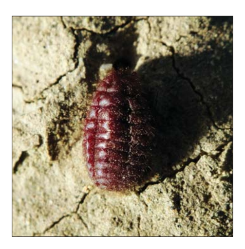
Fig. VIII. Porphyrophora polonica . At the end of March or the beginning of April, Polish cochineal larvae crawl out of their cocoons in search of perennial knawel shoots. As soon as they find one, they cling to it with suckers. In June they turn into two-winged imagoes and fly away

There are red grains in the ground, attached to the roots of some plants, especially the burnet saxifrage, wild strawberry, rye, (...) as well as many others. These are called czerwiec for, if they are not gathered in time, czerw (maggot) (...) infests and destroys them, which happens at the very beginning of czerwiec (June). The grains are dug up and gathered at a suitable time and sold to foreign lands, bringing great profit and considerable benefits. They are dried in full sun or roasted in an oven, while still hot after bread has been baked in it, so that they are not infested by maggots, and can be used to dye the most precious silk and baize<sup>11</sup>.