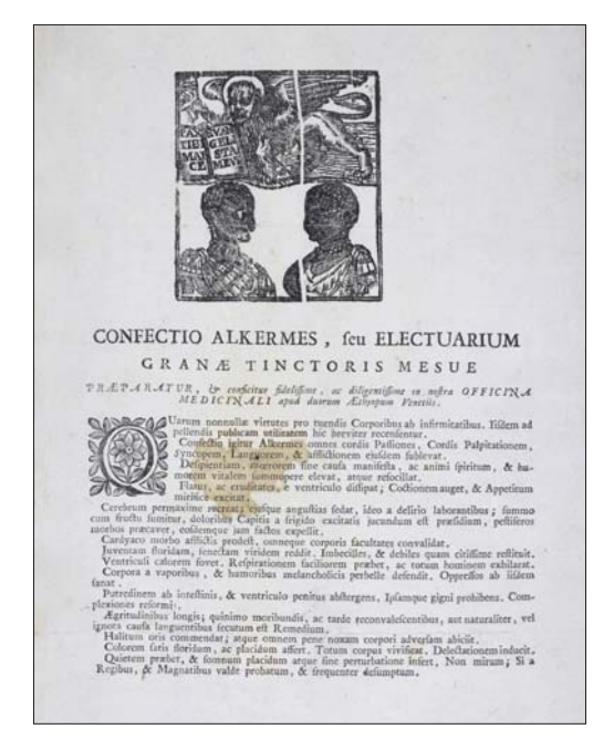
Fig. VII. A leaflet from a Venice's 17<sup>th</sup> century pharmacy "Apud duorum Aethiopum Venetiis" ("Under Two Venetian Ethiops") which advertises "Confectio Alkermes, seu Electuarium Granae Tinctoris Mesue" ("Alkermes confection or electuary, made of kermes grains according to Mesue's formula"), as a splendid medication for "all ailments of the heart, fatigue, and general weakness; it is good for headaches and respiratory problems; it improves the appetite, aids digestion, and stops bad breath, so no wonder it is often applied by kings and lords"