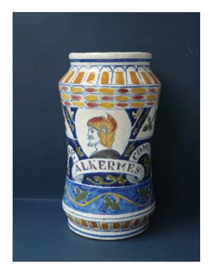
Fig. I. A maiolica jar (the front and the back) inscribed Conf. Alkermes Compl. Height: 26 cm. Provenance: Apteka Pod Orłem (Under The Eagle Pharmacy) in Gliwice, 1949.