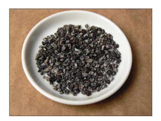
Fig. X. Left: impregnated cochineal females on a cactus leaf. Right: dried cocheneals