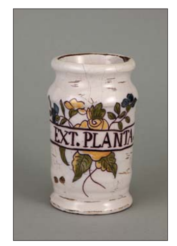
Fig. II. Albarelli of waisted, double-gourd and cylindrical form. The Jagiellonian University Museum of Pharmacy.

The concave part of the jar's body is divided into three horizontal sections. The top band is decorated with an abstract pattern in purple and yellow colours<sup>3</sup>, while the bottom band is covered with a green and yellow plant motif on a blue background. The back of the middle section is decorated with a green and yellow plant motif on a white background, in the front we have a scroll with the name of the medication and the profile of a man in a helmet – a motif willingly used by manufacturers of majolica in the period from the 16<sup>th</sup> to the 18<sup>th</sup> century (see Fig. III).