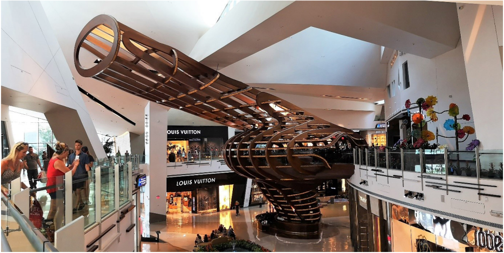
Fig. 7. “The Tree House”, designed by. Rockwell Group, CityCenter complex, design by Daniel Libeskind, 2009

the front with its convex side, while the other with the concave one), a hotel belonging to the Mandarin Oriental chain 13 , Vdara Hotel & Spa 14 as well as the Harmon Hotel 15 . At the base of this gigantic complex are the silvery titanium massings of the Crystals shopping centre by Daniel Libeskind, dynamically shaped as if having been broken up.