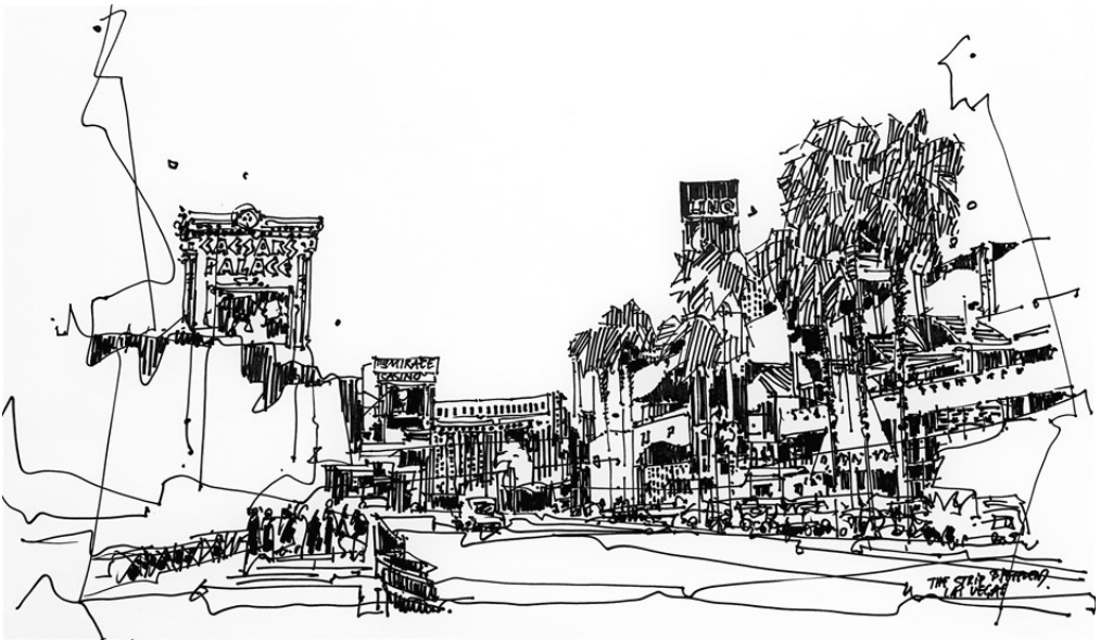
Fig. 10. The Strip, Las Vegas, Nevada; drawing by B. Malinowska-Petelenz

Las Vegas is also a melting pot of the best and worst achievements of the culture of the end of the twentieth and the beginning of the twenty-first century: flooded with plastic and cheap advertisements, but also the best and most expensive of what architecture has to offer. It offers fun from cheap roadside diners, but also exclusive entertainment from five-star hotels, in which even the greatest vices take on the character of luxurious and almost elegant amusement. It is also a city that presents front-page art that makes the headlines of sales reports. It is a city of kitsch, camp, wealth and trumpery – a city in which every element of the aesthetic discourse gets a sudden shot of botox, after which everything appears larger, fuller and more engrossing. Right until the end.