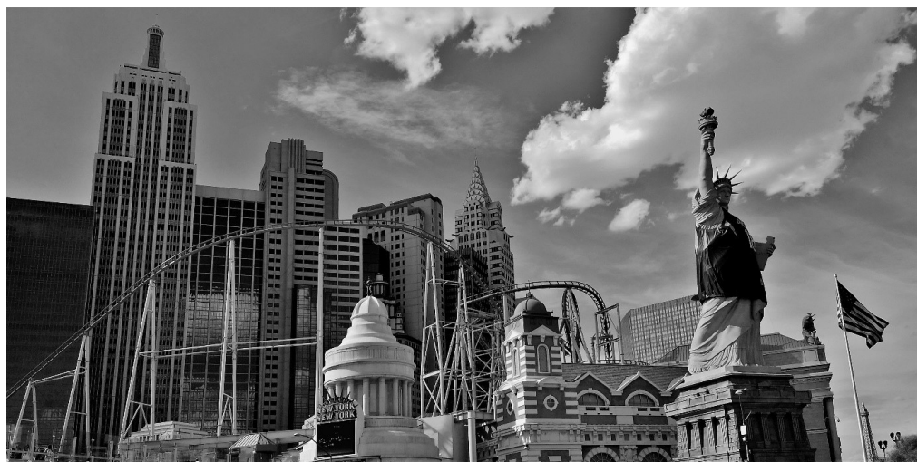
Fig. 3. The Strip, Las Vegas, Nevada; phot. by B. Malinowska-Petelenz

architects and aestheticians. The authors deconstructed modernist thought, or rather the vision of modernism that breaks away from romantic eclecticism, introducing sterilised and functional architecture that abolishes the dissonance between function and form, between massing and ornament. Venturi ennobled Disneyland, casinos and highways, and even the