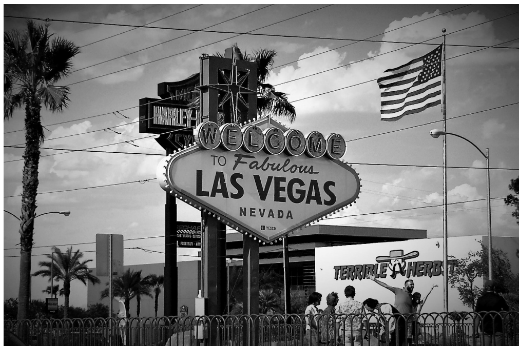
Fig. 2. The legendary sign „Welcome to Fabulous Las Vegas” near the entryway to the city, Las Vegas Boulevard