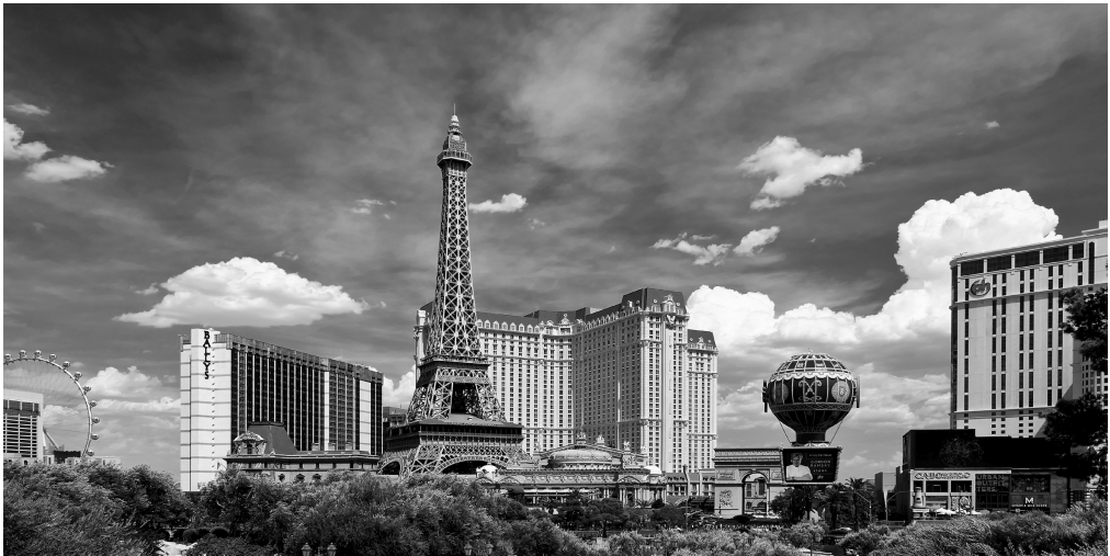
Fig. 9. Paris Las Vegas – view from Bellagio hotel