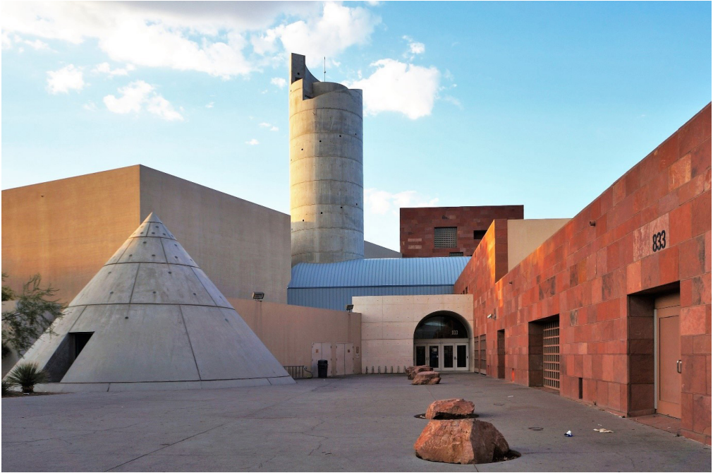
Fig. 5. Las Vegas Library and Discovery Museum, design by Antoine Predock, Las Vegas, Nevada, 1990; phot. by B. Malinowska-Petelenz