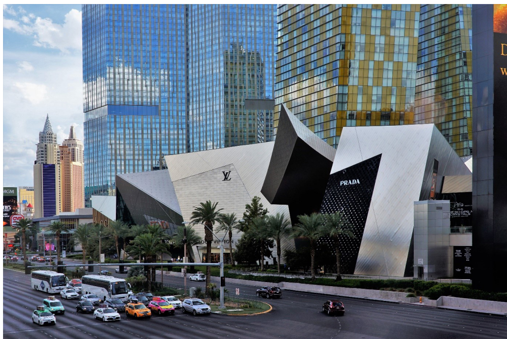
Fig. 6. The CityCenter complex, with the Crystals shopping centre in the foreground, design by Daniel Libeskind, 2009; in the background: Veer Towers, design by Helmuth Jahn and Mandarin Oriental, design by Kohn Pedersen & Fox

built according to the modern regional style, is clearly linked – both in form and colour – with the desert environment, in which it was created. Antoine Predock found inspiration in the local architecture of the South West and – similarly as in his other projects – avoided banal reproduction, instead proposing imaginative and highly individual variations on traditional subjects [6, p. 82].