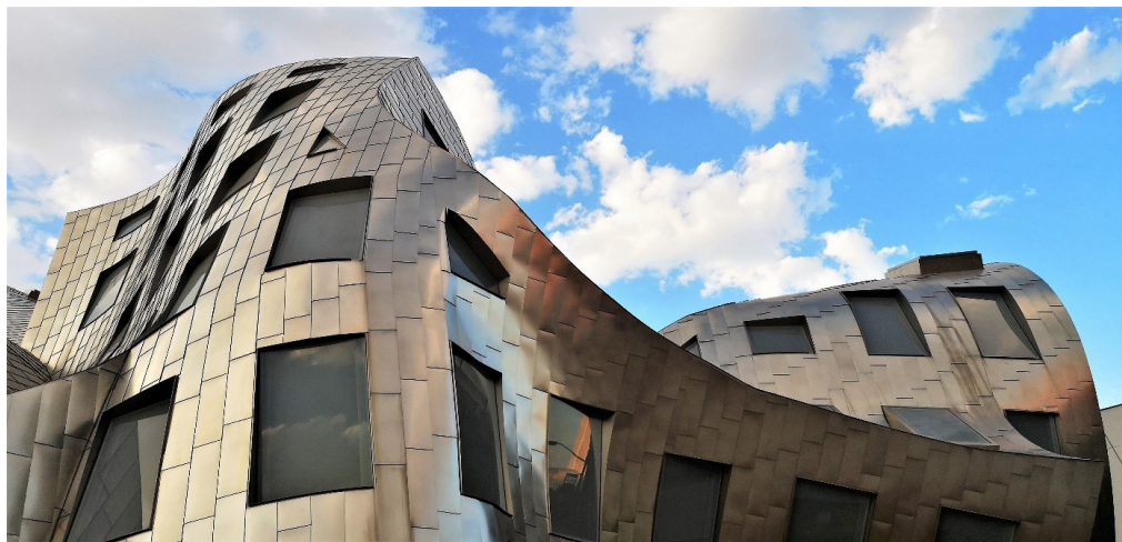
Fig. 4. The Lou Ruvo Center for Brain Health of the Cleveland Clinic, design by Frank Gehry, Las Vegas, Nevada, 2010