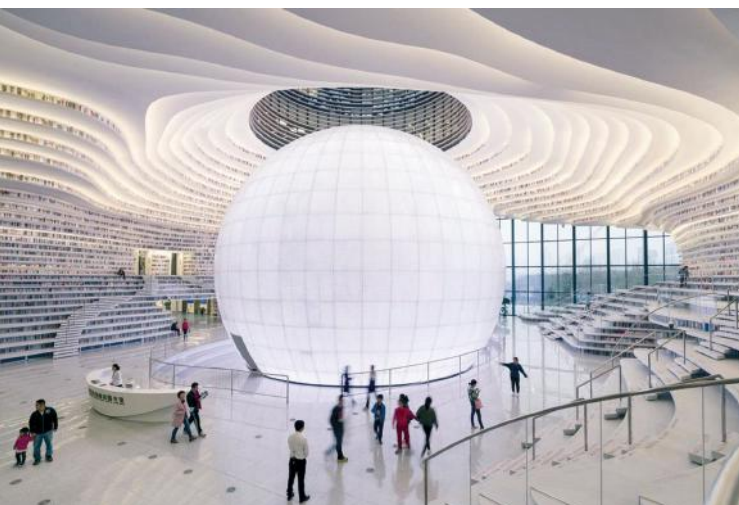
ill. 1. The Tianjin Binhai Library in China

The proposal that took the third place of honour in the competition for the design of the National Library in Prague impresses with its aesthetic form and sculptural extravagance (ill. 2b). Although the building's shape resembles a quicksilver bead after a fashion, the prototype is a cell structure that makes its nucleus the central depository, while the entire library space is engulfed in the cellular membrane of a translucent shell. 4