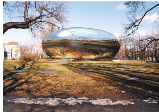
ill. 2. Designs of the National Library in Prague, 2007: a) by Jan Kaplický & Future Systems source: https://www.e-architect.co.uk/prague/national-library-prague (accessed on 4.02.20); b) by HSH architekti source: https://www.archiweb.cz/en/b/soutezni-navrh-na-narodni-knihovnu-cr-3-cena (accessed on 4.02.20)

Whatever the bizarre form of the library building, all of its authors use their principles of aesthetic expression in architecture. All of them intend to provide a high-quality and comfortable environment for their users.