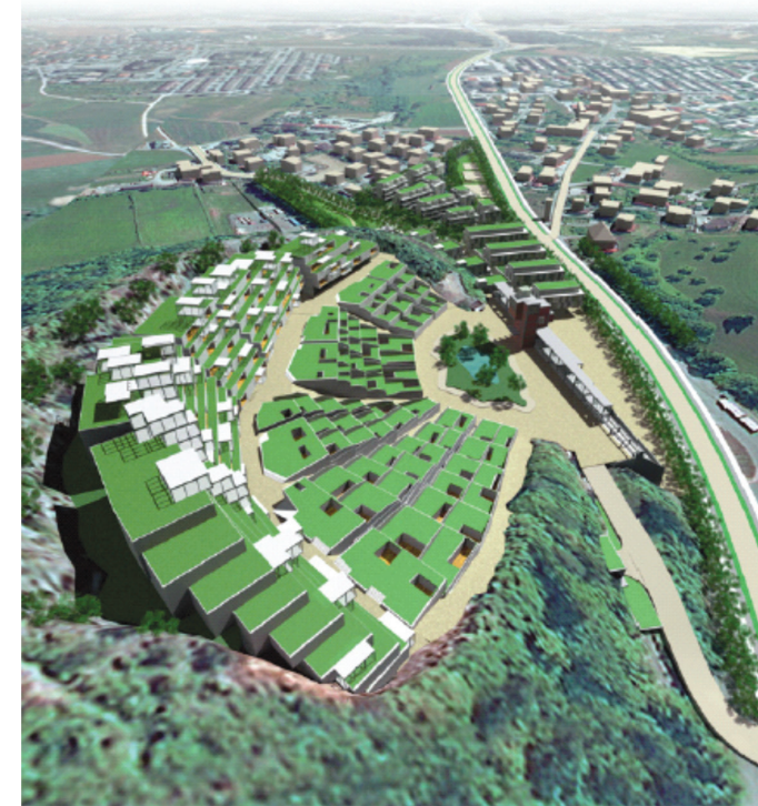
III. 3. A holistic revitalization plan of degraded area in the abandoned quarry and the asphalt base [10]

Green Building Council of Slovenia (GBC) reported that sustainable construction in the first place means the proper choice of materials and implementation. The two most im-