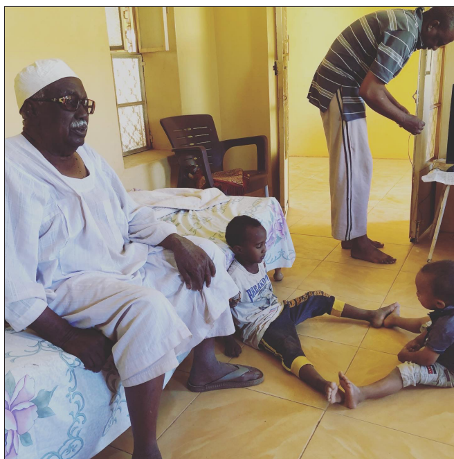
Fot. 5. Trzy pokolenia mężczyzn, Soba. M. Kurcz 2019