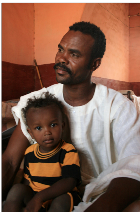
Fot. 1. Ojciec i syn, Hammur. M. Kurcz 2013