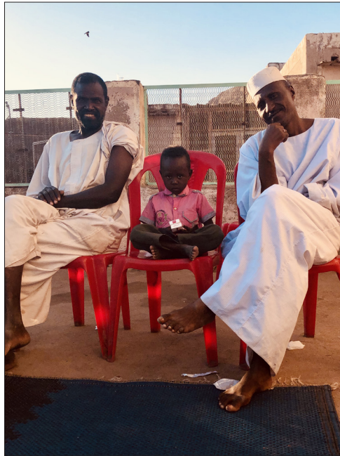
Fot. 3. W męskim gronie, Jebel Moya. M. Kurcz 2019