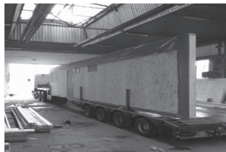
Fig. 2. Loading wall panels onto a vehicle (Nesbau)

Panel system has enormous potential for increasing efficiency in the design, production and construction phase. Manufacturing can be automated, however to increase the quality of production and to re-implement the construction workmanship is necessary. Bearing system of prefabricated wooden houses is completed within a few days. Other finishing and plumbing work is performed after the assembly of individual elements.