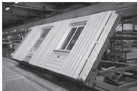
Fig. 1. Production hall of sandwich wall panels (La Vardera)