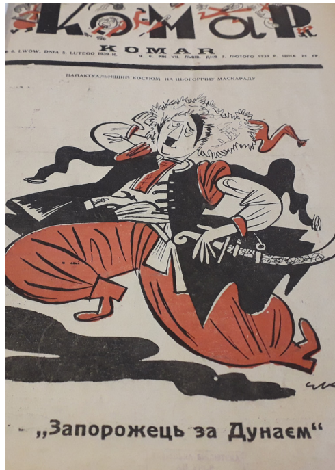
Figure 4. “Zaporozhets za Dunayem.” Image of Adolf Hitler as a “Ukrainian Cossack,” presented by Komar in the late 1930s.