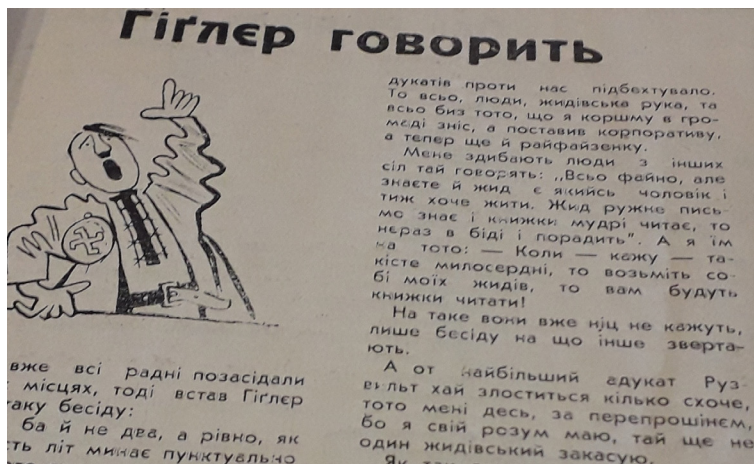
Figure 5. “Higler speaking.” Image of Adolf Hitler as a “Ukrainian village head,” presented by Komar in the late 1930s.