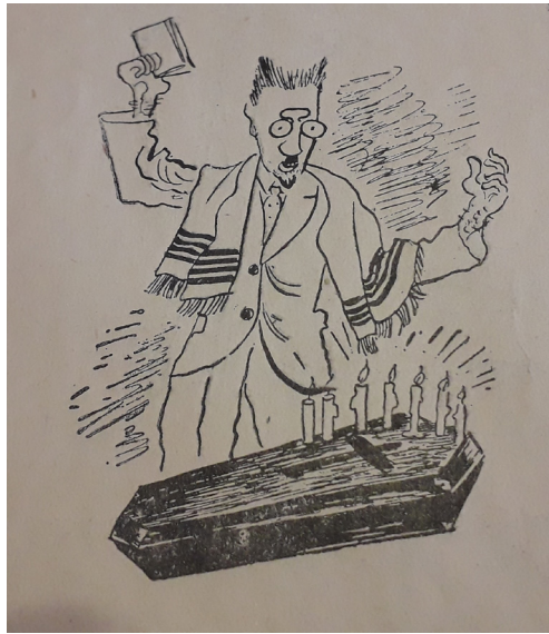
Figure 6. Image of Mykhailo Rudnytskyi as a “Jew-mason.”

So, what image did these journals aim to create through these caricatures? First, the Rudnytskyi family was portrayed as a separate clan that tried to cover different spheres of Ukrainian life (including politics, literature, music, and the women’s movement). Second, the level of internal solidarity of the members of this family was absolutized in their willingness to always come to the aid of each other. Third, all their activities and behavior were explained by their Jewish origins. According to Serge Moscovici’s theory of social conception, a simplified image of perception and explanation of more complex phenomena is a convenient way of forming a certain kind of thinking among the masses. After all, the idea was the match of the image. 44 Thus, these cartoonists, in focusing primarily on the peasants and the rural intelligentsia, tried to weaken the real or imagined influence of the Rudnytskyi family on Ukrainian cultural and political life in interwar Galicia.