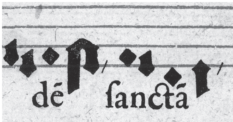
Fig. 7. An example of the exact positioning of kerned neumes and letters from 1629 Graduale , p. 247 (Jagiellonian Library, Kraków, shelf mark 311397 IV)