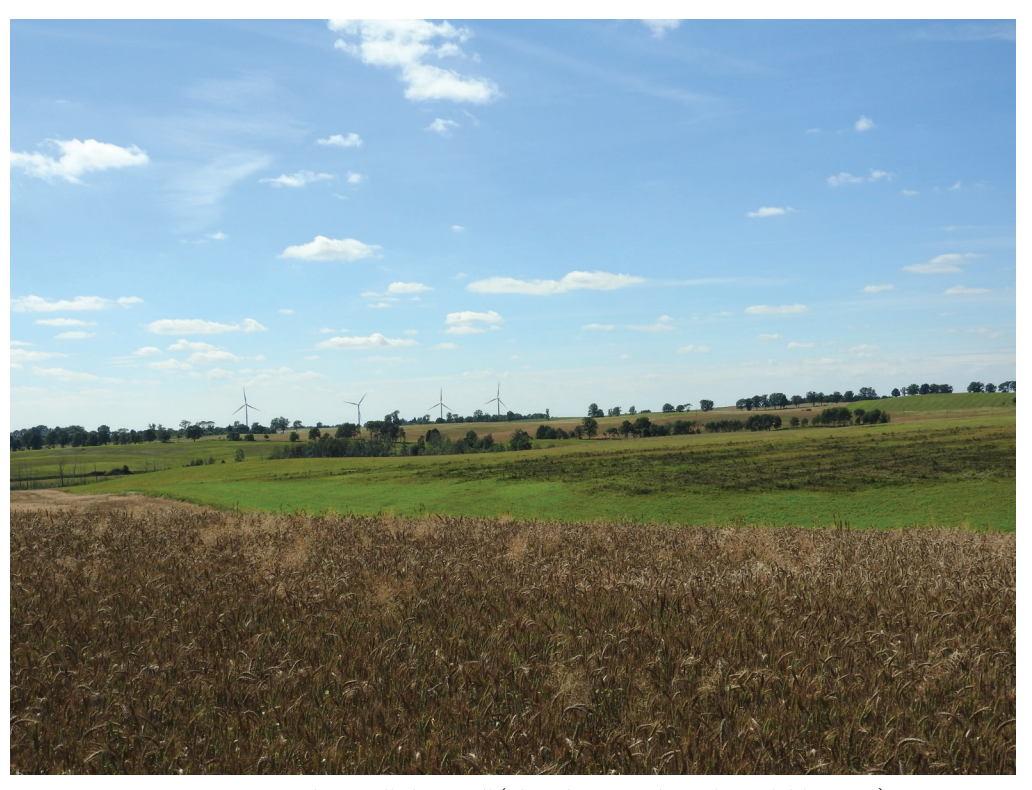
Fig. 4. Vista point, the so called Cat Hill

Analysing the existing scenic values inside the site, it is necessary to name the viewpoint in the form of the so-called Cat Hill [Pol. Kocia Górka], which allows for far-reaching insights into the area in practically every direction, exposing a typical landscape of agricultural crops (Fig. 4). However, it should be noted that this point, although it has unquestionable scenic