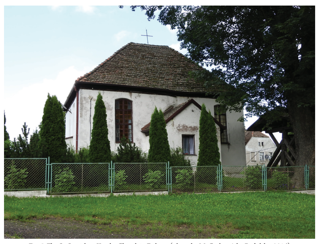
Fig. 5. The St. Stanislaus Kostka Church in Dalewo (photo by M. Czałczyńska-Podolska, 2016)