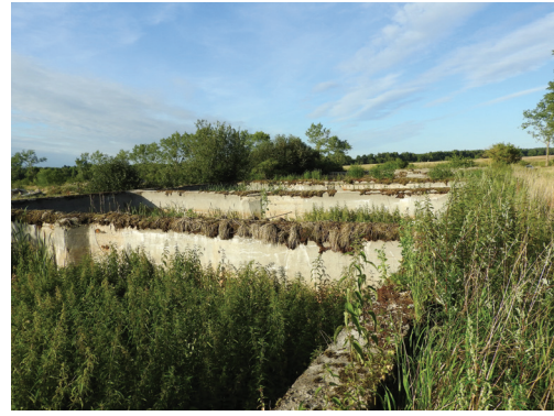
Fig. 7. Zarańsko, area of the former state farm – silos