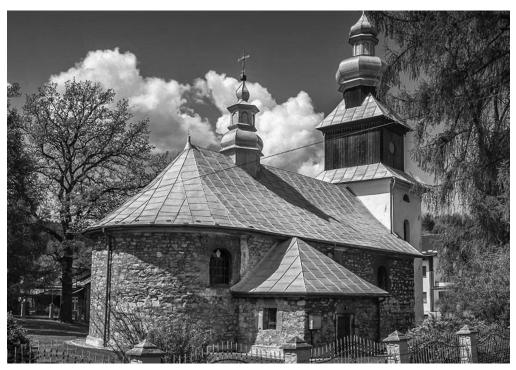
Fig. 11. Orthodox church of Archangel Michael in Zagórz