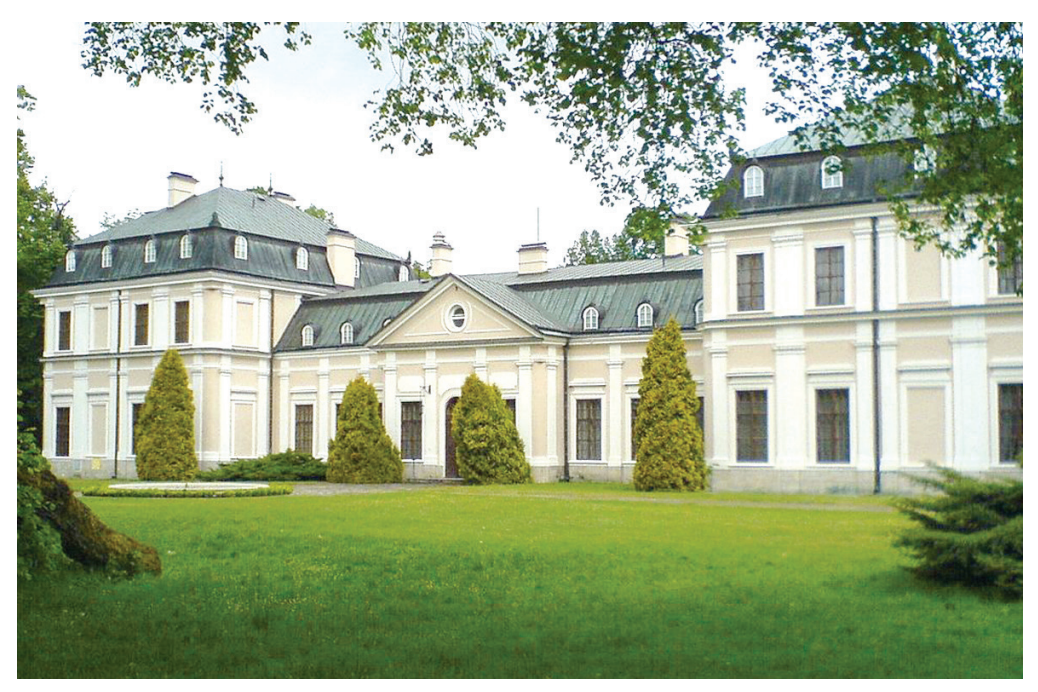
Fig. 8. View of the palace in Sieniawa