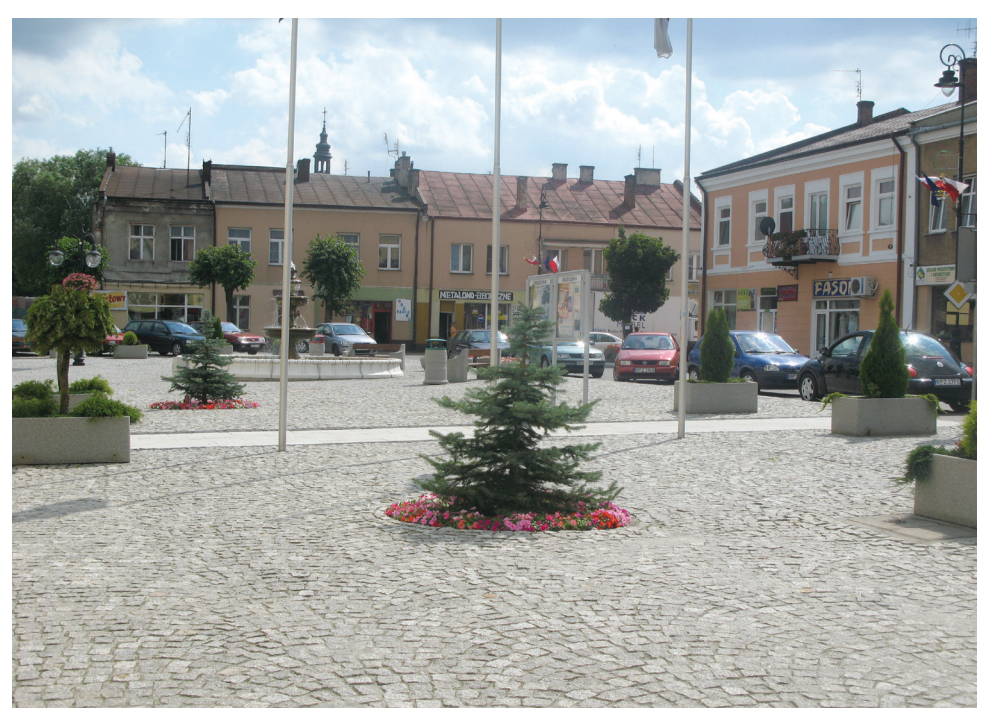
Fig. 2. Market square in Sieniawa