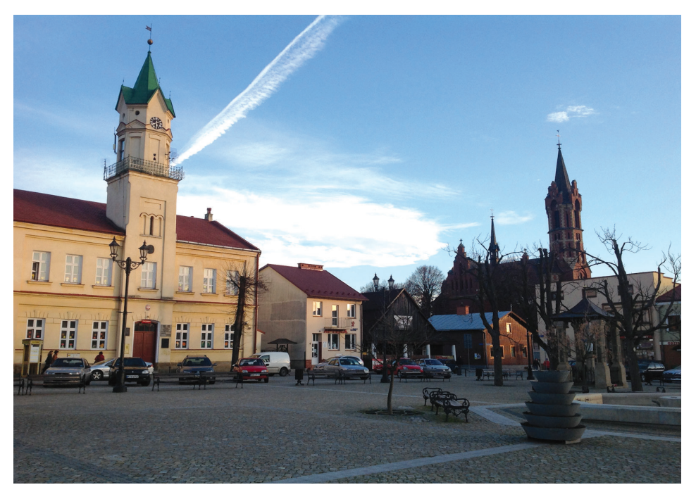
Fig. 6. Fragment of the main square in Kołaczyce nowadays. View from the north-west.

Fig. 5. Urban layout of Kołaczyce on an aerial photo