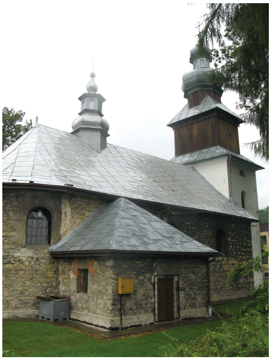
Fig. 3. Orthodox church in Zagórz