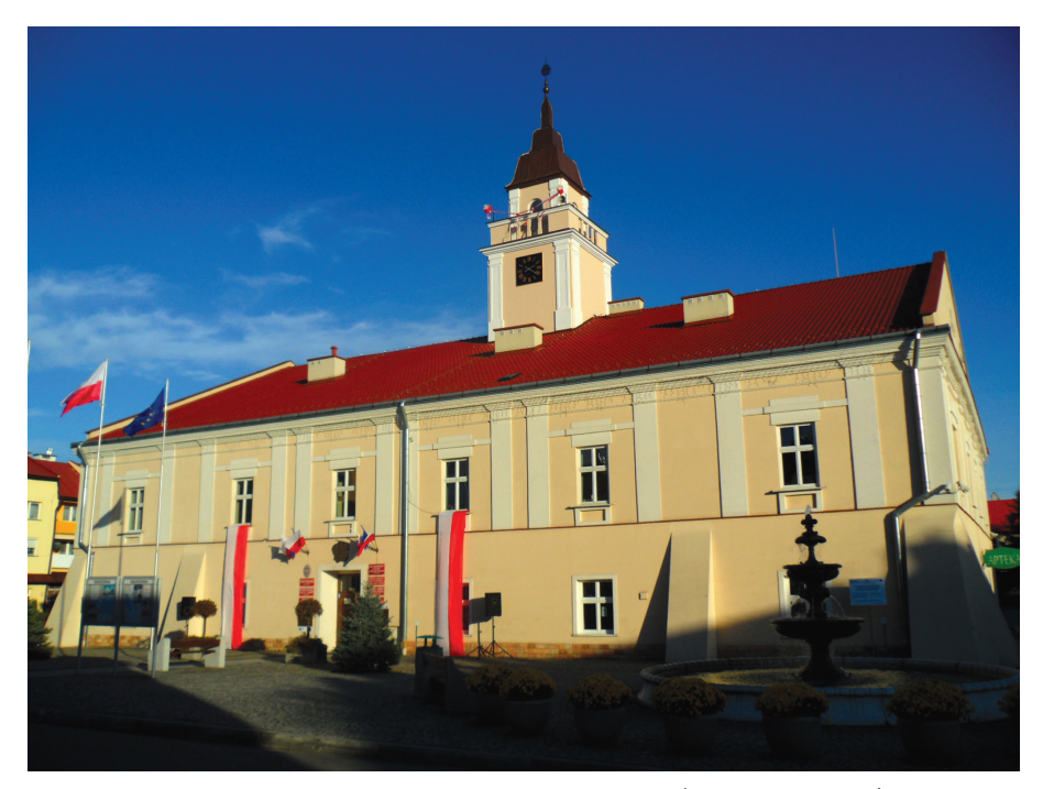
Fig. 9. View of the western elevation of the town hall

A particularly picturesque accent in the Zagórz townscape is the ruin of the Discalced Carmelites monastery. The complex was erected in the 18<sup>th</sup> century, in the late-Baroque style. It was located on the Mariemont Hill (345 m AMSL), in the bend of the Osława River. The former monastery complex consisted of the church of the Assumption of the Blessed Virgin, the monastery and utility buildings. The golden era of the monastery lasted until the first Partition of Poland. Later the monastery fell into decline, having been a site of many battles and fires [9, pp. 29–31]. Despite numerous attempts, it has never been rebuilt. Nowadays, it is a valuable historical monument in Zagórz, important for residents and fascinating for visitors.