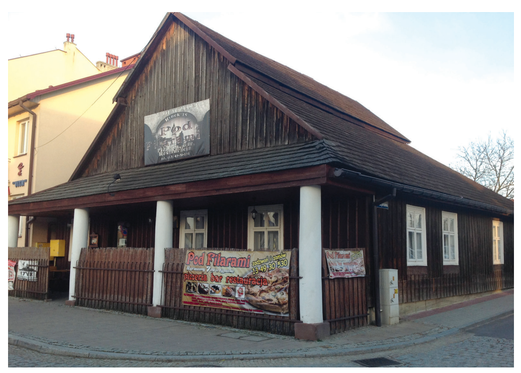
Fig. 7. View of the former post office building on the east frontage of the main square