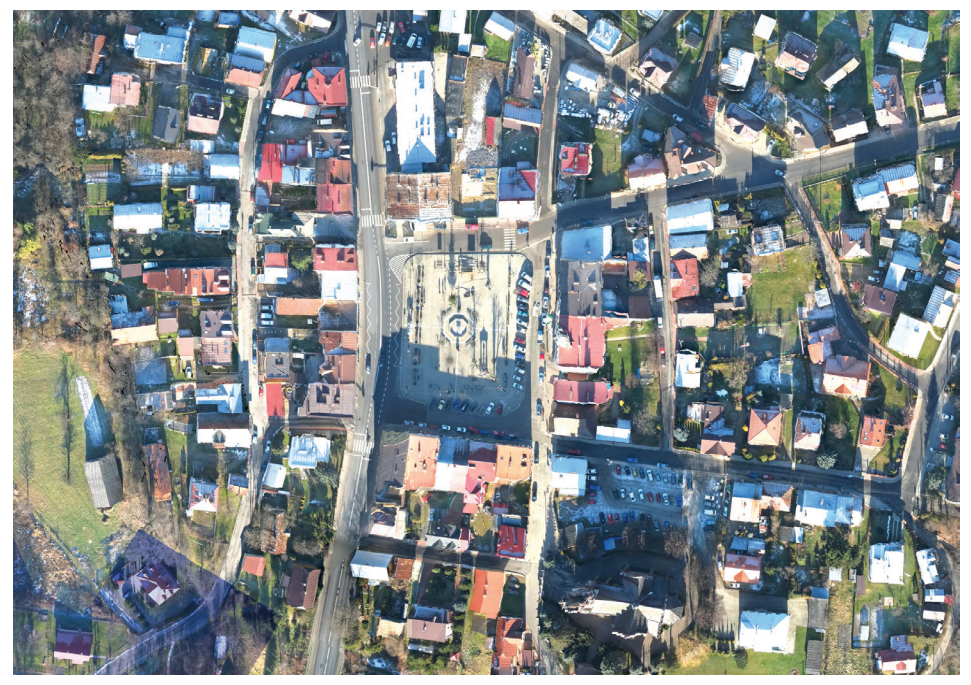
Fig. 5. Urban layout of Kołaczyce on an aerial photo