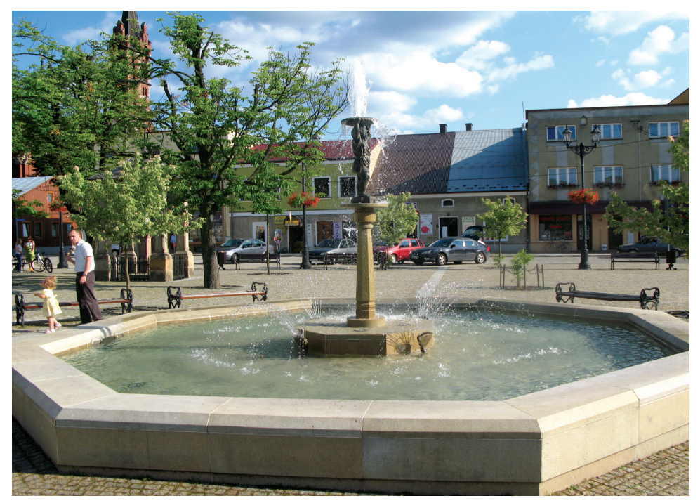
Fig. 1. Historic market square in Kołaczyce