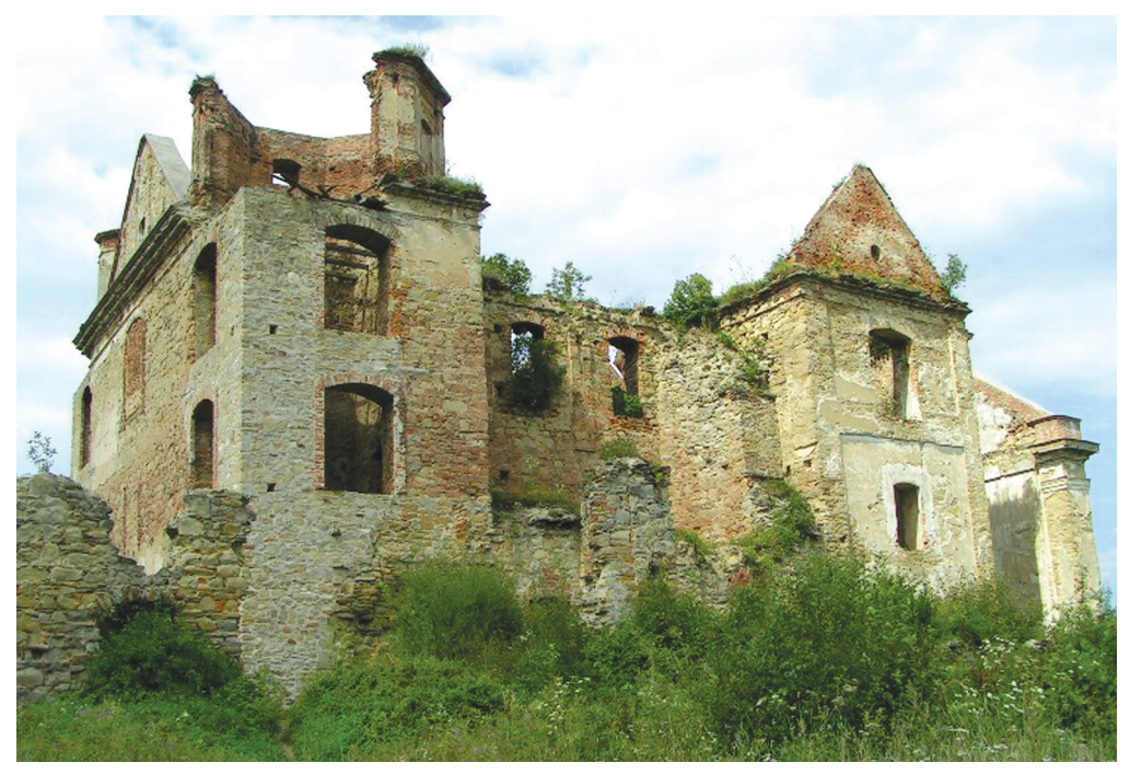
Fig. 10. Ruins of the Discalced Carmelites monastery in Zagórz