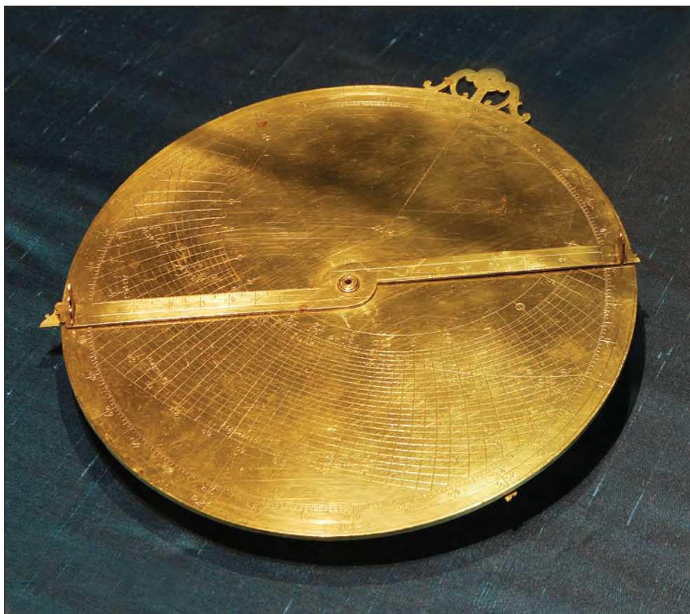
Ill. II. Circles of proportion, Elias Allen, London, c. 1630 (Museum of Science of the University of Lisbon, Inv. No. MCUL 501).