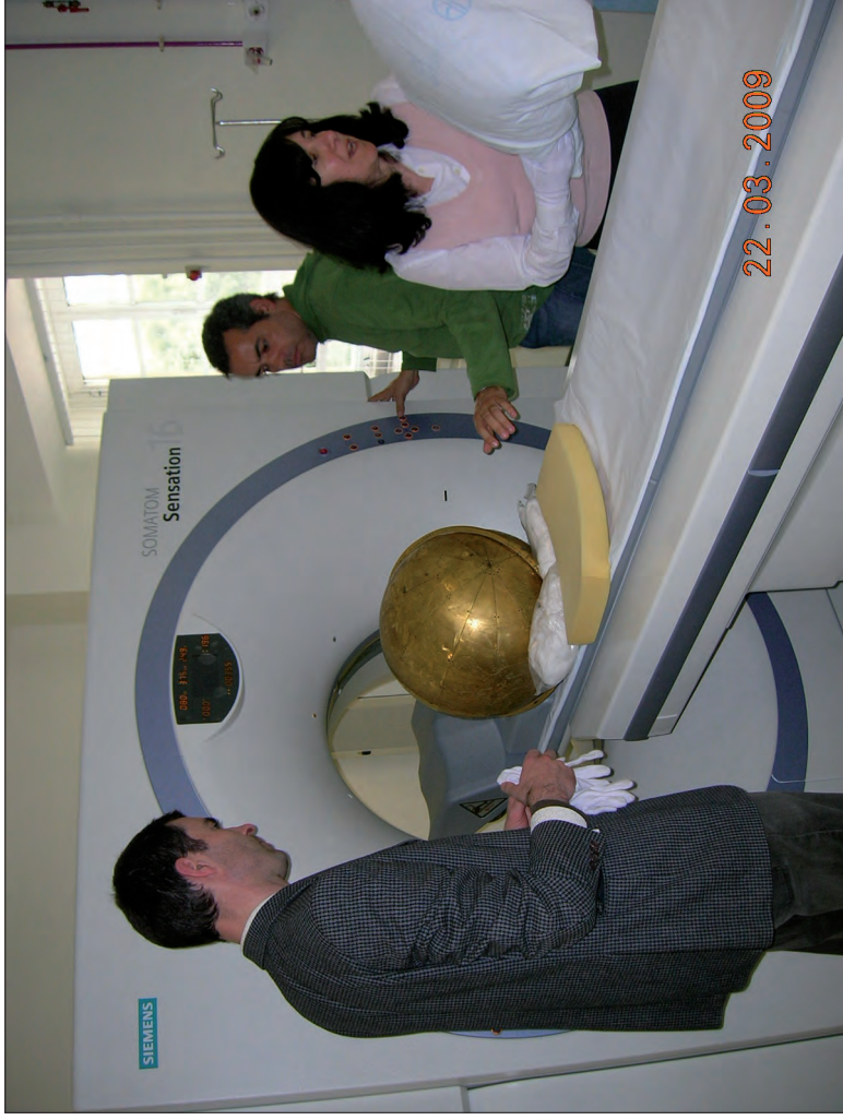
III. VIII. The 1575 Schissler globe, from the Palace of Simtra-Vila is submitted to a CT-scan at the Portuguese Institute of Oncology in Lisbon for study, March 2009, Photo M.C. Lourenço