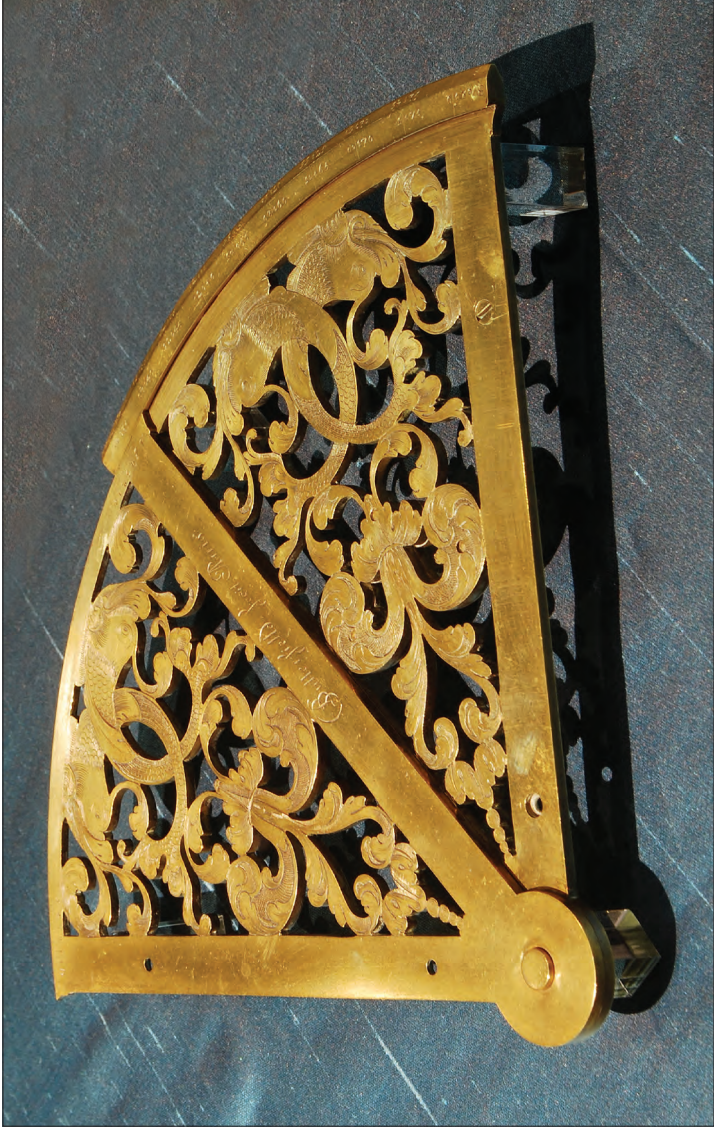
III. III. Equatorial sector (fragment), Michael Butterfield, Paris, c. 1670 (Museum of Science of the University of Lisbon, Inv. No. MCUL 1163).