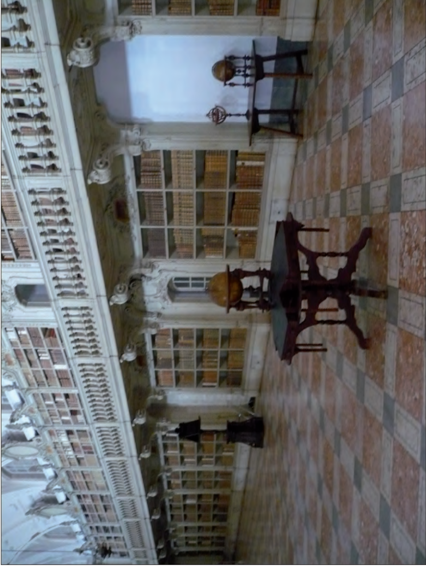
III. VII. Two globes and an armillary sphere at the Library of the Palace of Mafra.