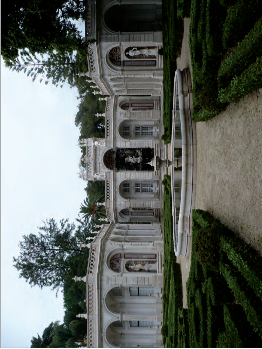
III. VI. Gardens of the Palace of Belém, Lisbon.