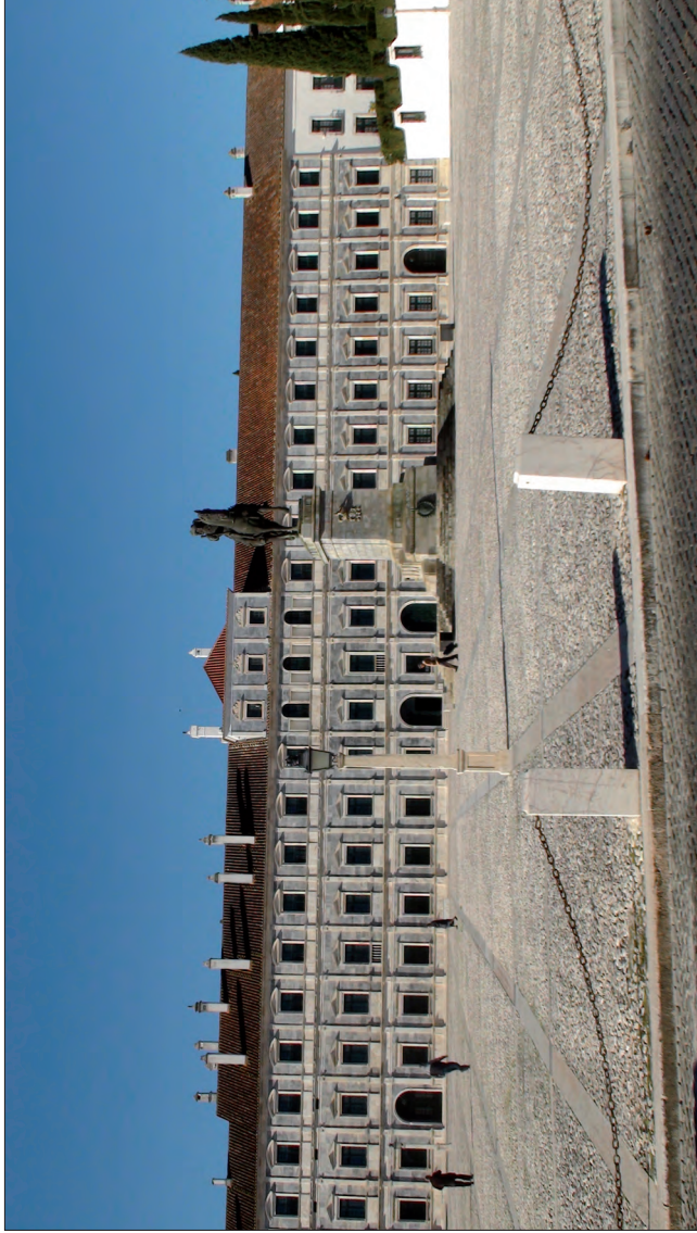
Ill. IV. The Palace of Vila Viçosa.