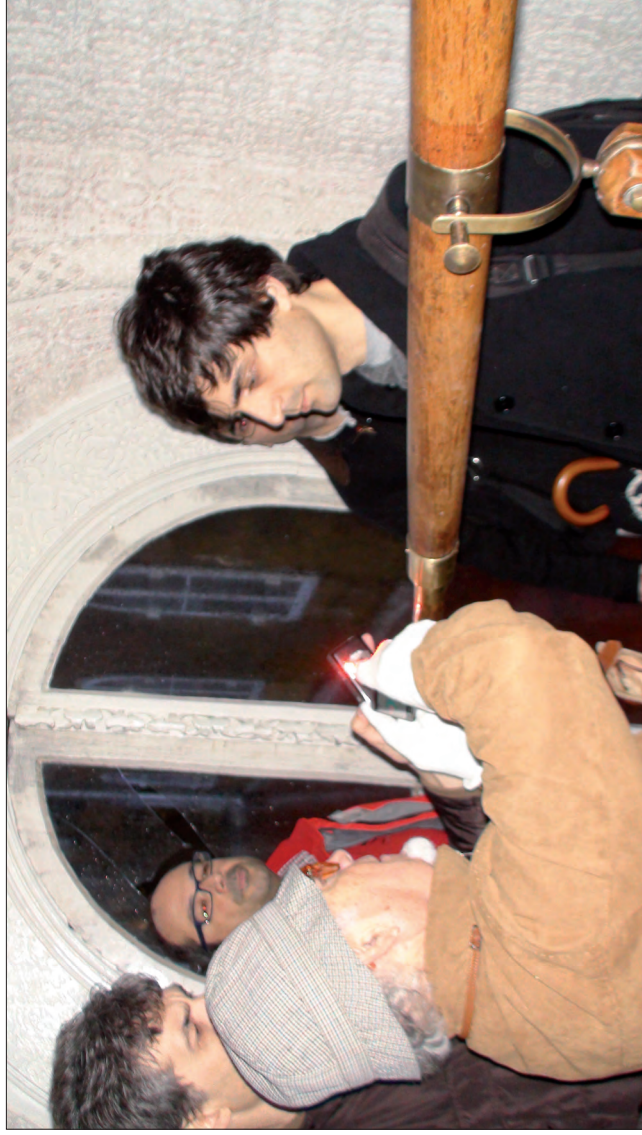
III. V. Research team members during the survey of the palaces; here, a telescope at the Palace of Sintra-Pena, December 2010.