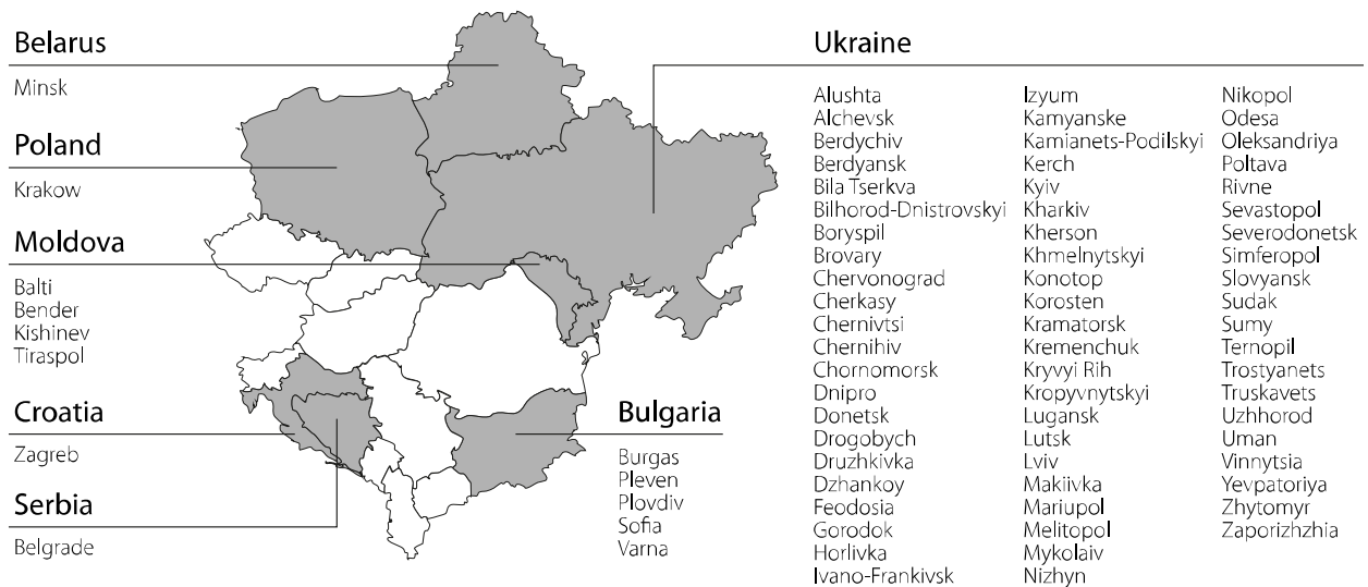
Fig. 2. Geography of introduction of the digital service "EasyWay" in the countries of Eastern Europe.