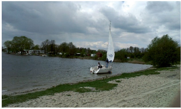
Fig. 3. Overview of the Bagry Water Body