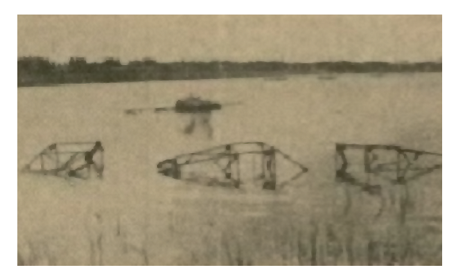
Fig. 2. The view of the fragment of the water body with the sunk remaining of mining constructions – 1986

In 1973 a big scale of the project was emphasized in press. Corrections in the management plans resulted from the acceptation of new investment programme, defining the division of the area covered by the plan, into subsequent stages of implementation. Until 15th September 1973, In the city plans, there was making the technical and economic premises for the management of the area planned for the localization of cubature objects [11].