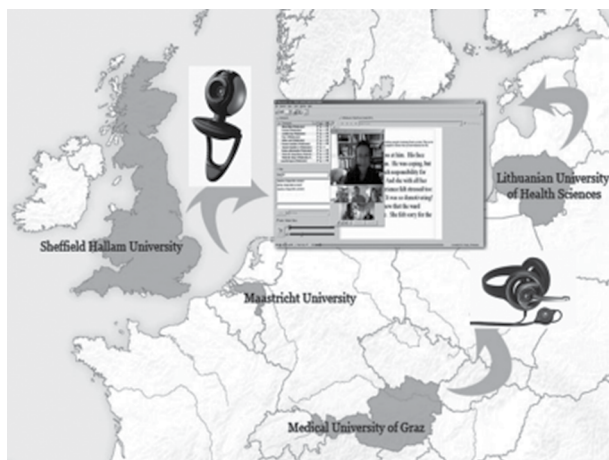
Figure 3. Online collaboration of the educational institutions. Source: Book covers of educational materials based on Czabanowska K., Smith T., et al., Leadership for Public Health in Europe. Nominal Plan, Maastricht University, Maastricht 2013.