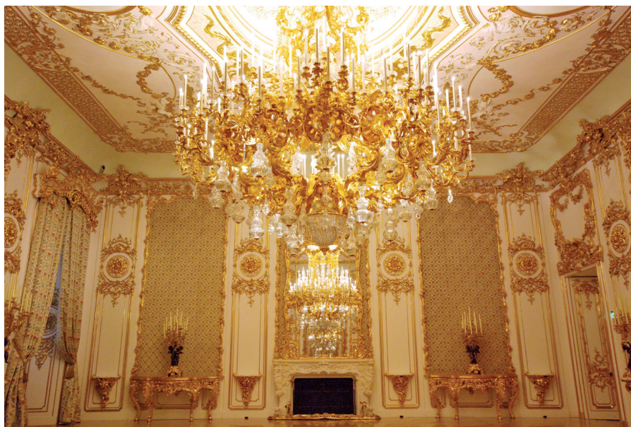
III. 2. Quadratsaal chandelier II. 2. Kandelabr w Sali Kwadratowej