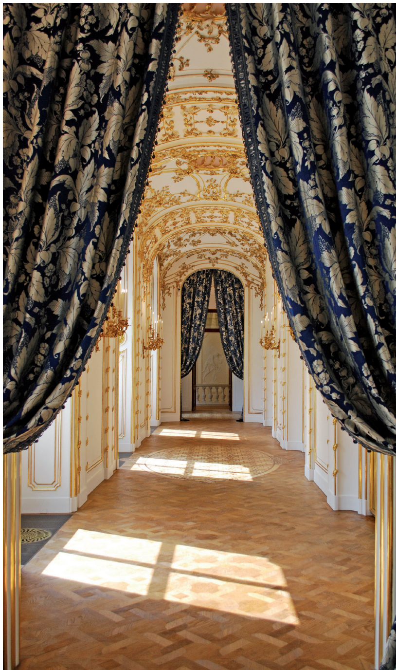
III. 5. South Vestibule 2 nd floor after restoration