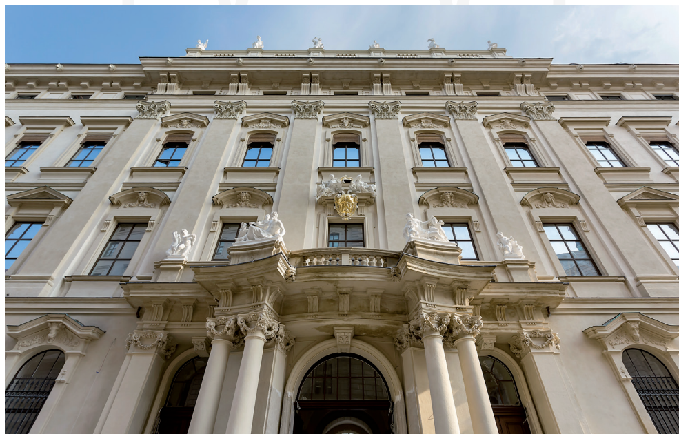
III. 3. Façade of Liechtenstein Palace after restoration II. 3. Fasada Pałacu Liechtensteinów po restauracji