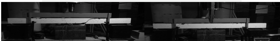
Fig. 2. Shear failure of the beams

The crack patterns for the RC and BFRC beams were distinctly different. While the RC beams without transverse reinforcement exhibited a single inclined crack followed by a brittle shear failure, all BFRC beams showed at least two diagonal cracks. The presence of fibers, however, allowed the development of multiple diagonal cracks and the widening of at least one of them prior to a shear failure, which provided some warning about the imminence of failure. Even for these beams the failure was rather sudden.