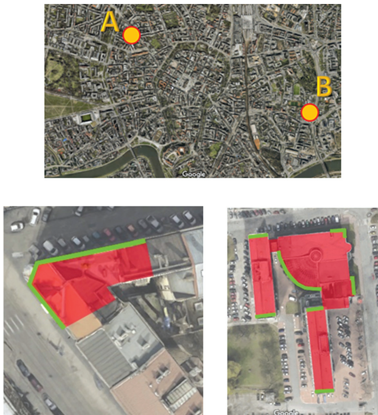
Fig. 1. From the top: location of the analyzed buildings, presentation of the area occupied by the building (red) and location of the elevation available for greening (green). A – tenement house “Pod Pająkiem”, B – Municipality of Krakow, own work based on photo from [21]

for greening was calculated. It has also been calculated how many Fagus sylvatica individuals could grow on the area occupied by the building and what would their efficiency in absorbing of PM be.