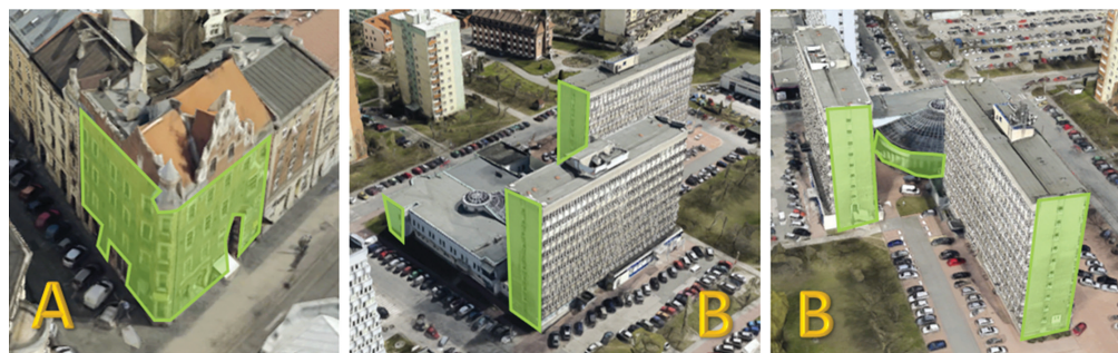
Fig. 2. Visualization of green walls on the facades of the analyzed buildings. The area of green walls excluding window and door openings is marked in green. A – tenement building “Pod Pajakiem”, B – Municipality of Krakow, own work based on photo from [21]

Explanation: A – “Pod Pajakiem” tenement house (base of the building – 450 m 2 , elevation for the creeping vine – 690 m 2 ), B – Municipality of Krakow (base of the object – 2,900 m 2 , elevation for the creeping vine – 1,300 m 2 ) E – elevation available for greening, P – base surface of the building, own work