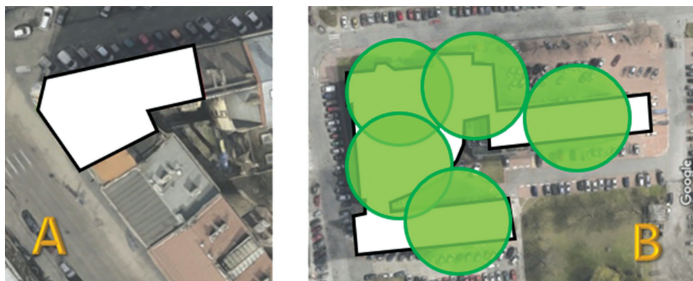
Fig. 3. Illustration of potential tree plantings (green circles) in the areas occupied by the analyzed buildings (white color). A – tenement building “Pod Pajakiem”, B – Municipality of Krakow, own work based on photo from [21]