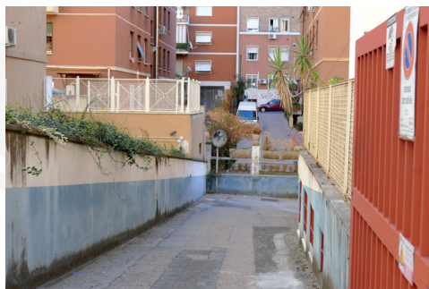
III. 4. Villa Urban Block between streets Albenga/Cividale del Friuli/Ivrea/Acqui