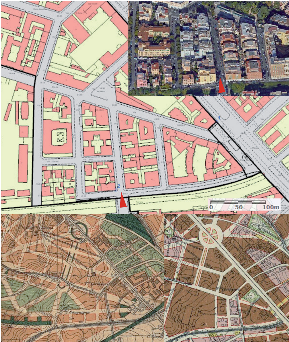
III. 3. Via Acqui Villa Urban Blocks : a – as today, bird eye view [31], b – as today, plan [33], c – as in PRG Roma 1909 [34], d – as in PRG Roma 1931 [35]

In France a form of transition from a block divided into plots towards a uniform type of ownership and use were HBM social housing complexes (private or public).