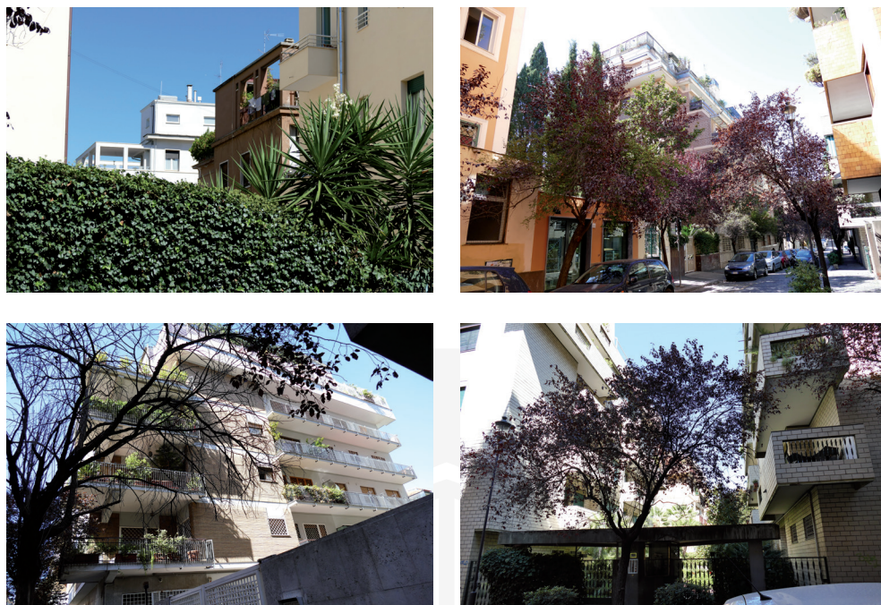
Ill. 2. Villa Urban Blocks – Via Arabia