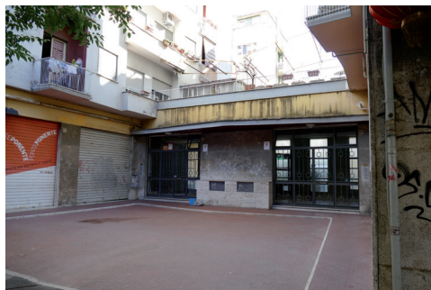
III. 5. Villa Urban Block between streets Albenga/Acqui/Stabia/Mondovi