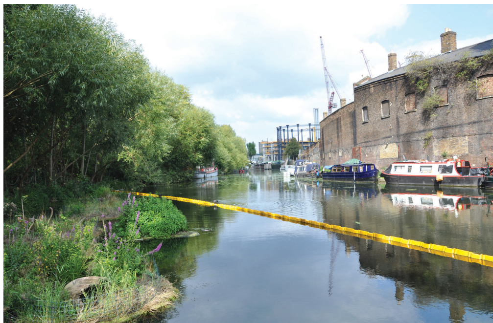
Fig. 1. View over the waters of the canal from the Viewpoint platform. Floating islands, barge with the floating garden and the cast iron structure of Gasholder No. 8 are to be seen in the background (photo by U. Nowacka-Rejzner, 2014)

contemporary tendencies in designing green areas. The spatial frame of the park is created by the beautiful cast iron structure of the largest gas container Gasholder No. 8, until the year 2000 functioning as part of the Pancras Gasworks. In 2011, the container structure was disassembled, renovated and, in 2013, reassembled at its present location on the left bank of Regent's Canal, opposite St. Pancras Basin. The area of the park, elevated above the waters of Regent's Canal, is a place offering unique views over the canal, the barges mooring at the basin and the greenery of Camley Street Natural Park (Fig. 1.)