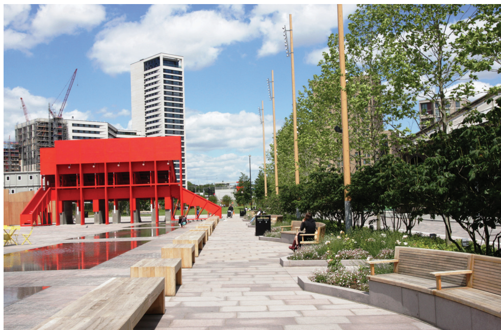
Fig. 4. Water in the space of Lewis Cubitt Square

A green extension of Lewis Cubitt Square to the north is Lewis Cubitt Part 9 open to users since 2015, the main green common of the revitalised area in King's Cross. The park has the shape of a rectangle of the area equal to 0.65 ha. On both sides of the park, the ground has been raised along longer ends. The gentle variation of the ground levels, defined by soft elevation lines, outlines subtly semi-private places in the space of the park encouraging individual relaxation and leisure.