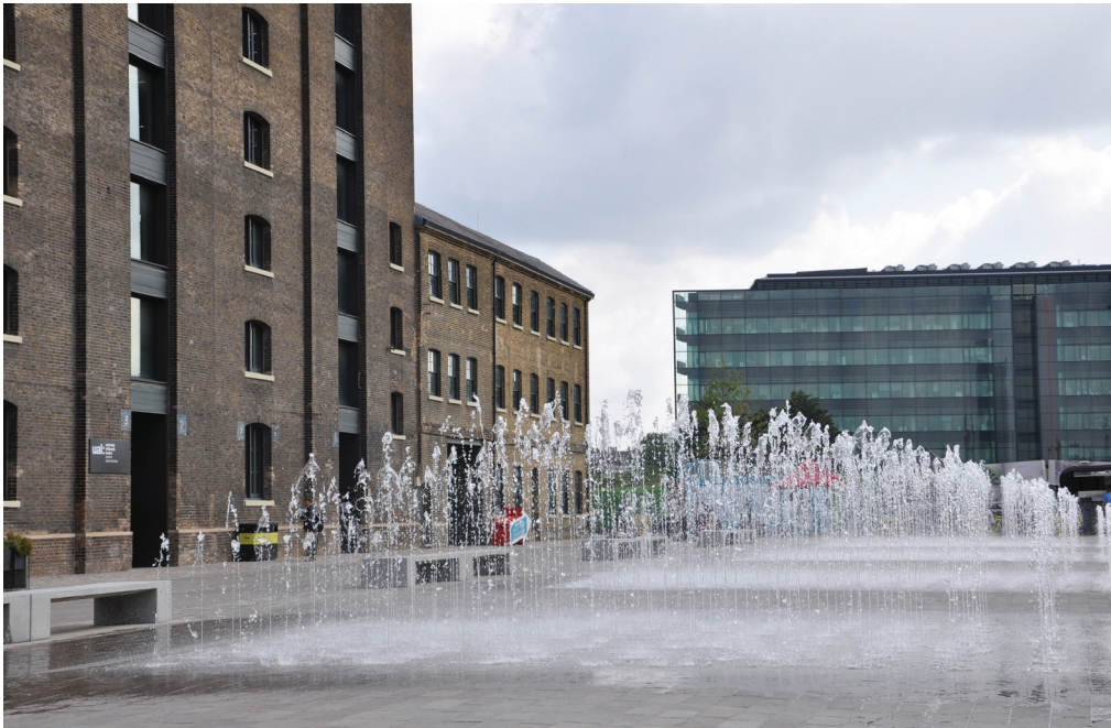
Fig. 3. Granary Square

the squirting jets serves as a platform for dancers to practice their routines, for dance shows or simply as a playground for children and adults alike. The designers have created a vibrant, changing and colourful space, which attracts various users: those who like to just watch and those who actively participate in water spectacles or events organised here, always in a unique atmosphere. Water tables in the space of the square are not only a compositional element but they also bring to mind its water-related past – the reloading basin that existed here in the 19 th century. Another reference made to the past of this place is the line of the former canal bank worked into its surface and a preserved mooring stanchion. On the other hand, a renovated rail turntable, covered with a glass panel, located in the north-western part of the square, and a preserved part of the former railway track are reminders of the industrial and rail history of Granary Square. Opening the square to the waters of the canal by the terraces of the Canalside Steps makes the space seem even larger (Fig. 3).