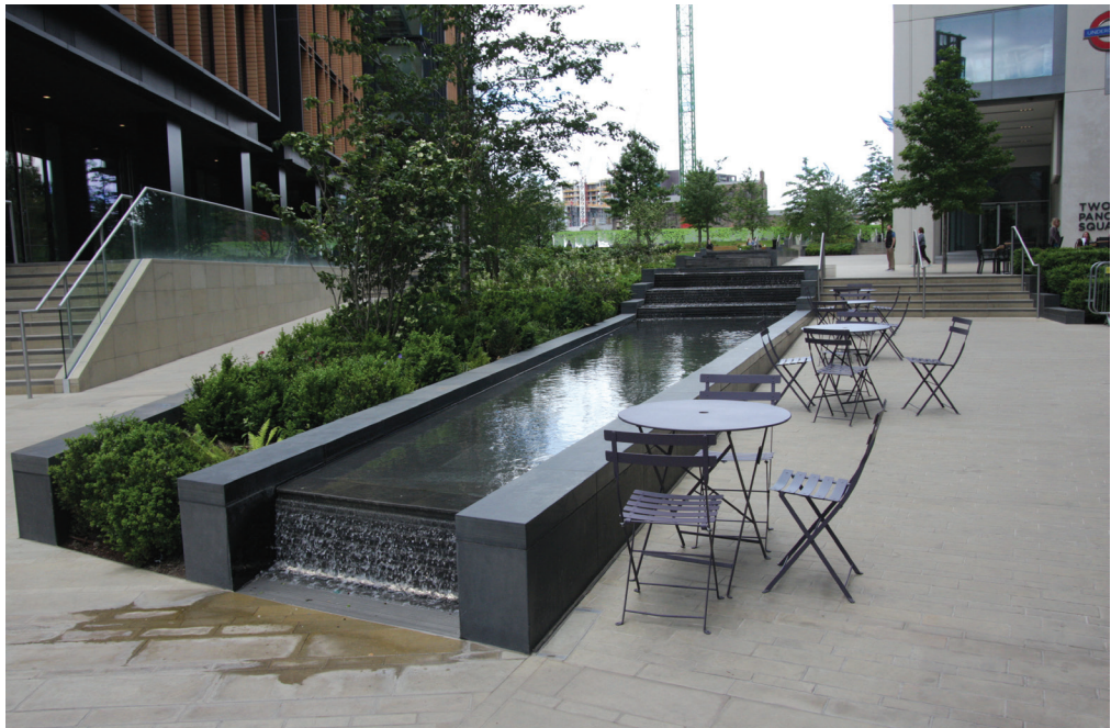
Fig. 6. Pancras Square