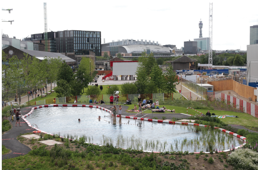
Fig. 5. Art installation Of Soil and Water: King's Cross Pond Club in the area of Lewis Cubitt Park

At present, the greatest attraction in this part of the King's Cross revitalised area is the pond 10 situated at the end of the green space of Lewis Cubitt Park and with a building site in the adjacent area. The water reservoir, open for use on the 15 th May 2015, is a temporary art installation 11 promoting water recycling realised within the framework of Relay Arts Programme. Water in the pond is cleansed in a closed cycle with the use of various species of water plants. Vegetation typical of wetland has been planted to the north of the pond, in its direct vicinity. Similarly to the floating islands placed on the waters of Regent's Canal, the Floating Forest Garden or the Viewpoint floating platform, the pond is to draw attention to the dependencies and mutual relations between humans and the natural environment as well as to the results human activity brings to the environment. It is yet another place to stop and look for the answer to the question what significance has sustainable development, where is the place for humans, water and greenery in the space of the city. Simply by staying in this space of water and greenery and by looking at it and at the neighbouring building site from the viewing platform located on the northern side of the pond, visitors have the possibility of watching the ongoing transformations and, in a certain way, participating in them (Fig. 5).