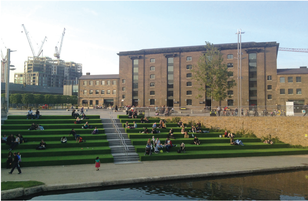
Fig. 2. View over the Canalside Steps located on the left bank of the canal; in the background the building of Central Saint Martins University of the Arts situated at Granary Square