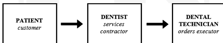
Fig. 1. The flow of information in the patient-dentist-dental technician system

The main problem in the implementation of orders (restoration project) from the range of dental engineering, is the fact that there is a one-way flow of information. In this system, there are three cells: the customer (patient), dentist and dental technician (Fig. 1). In this system, the patient is in direct contact with the doctor who performs the treatment and decides on the type of required restoration [11–14]. The dentist forwards recommendation to the dental technician. In this system, the contact between the patient and the dental technician is completely omitted. This means that, in theory, the patient does not have a major impact on the type of order and has no possibility to submit requirements. The dentist is an intermediary in communication during the process of determining the details of project. It should be noted that, in most cases, the patient has no possibility of selecting operational parameters of restoration (the choice of materials and manufacturing techniques, taking into account the characteristics and prices of the final product) – therefore we refer to a one-way flow of information in the patient – dentist – dental technician system.