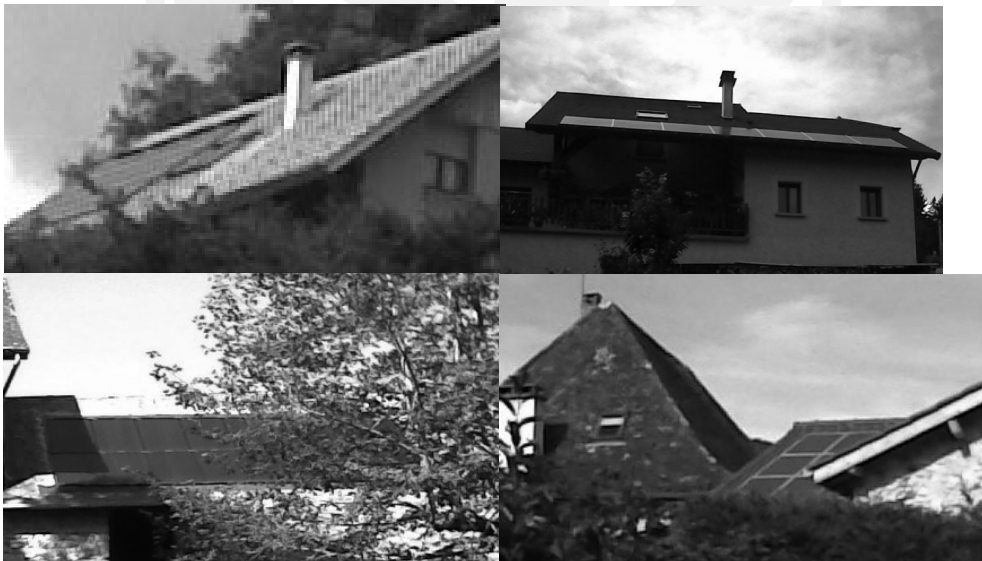
Fig. 1. Photographs of analysed systems, from left 1, 2, 3, 4