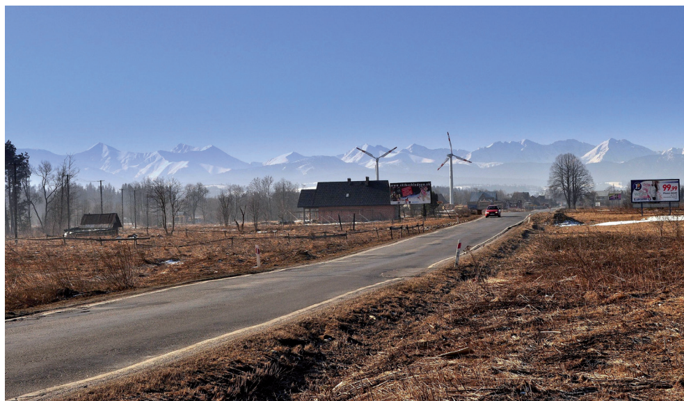
Ill. 1. Traditional view on Tatra's Mountains with a new landscape element of a pair of wind turbines