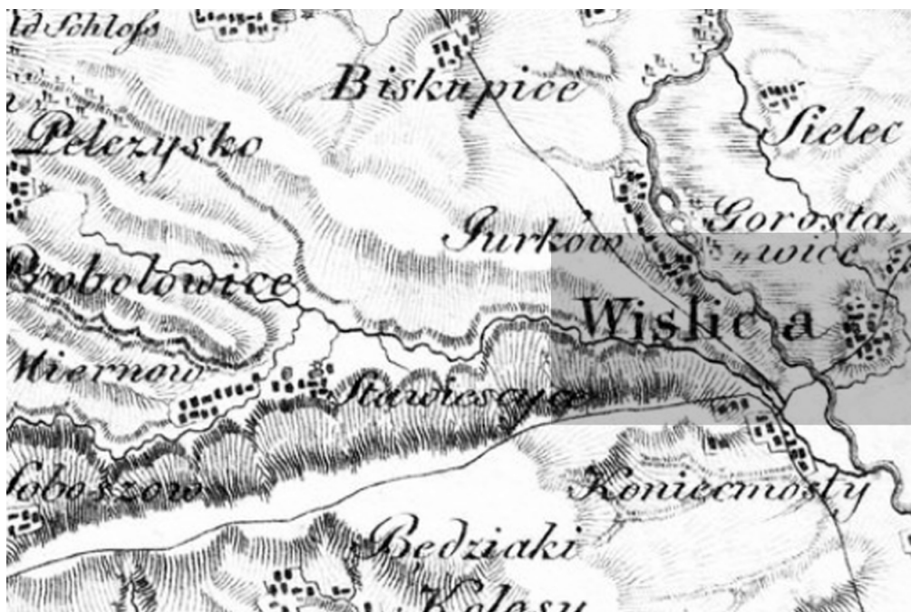
Fig. 2. Wisłica on the map by Anton Mayer von Heldensfeld from 1808, copy in the Archive KHAUiSzP WA PK, s.v.