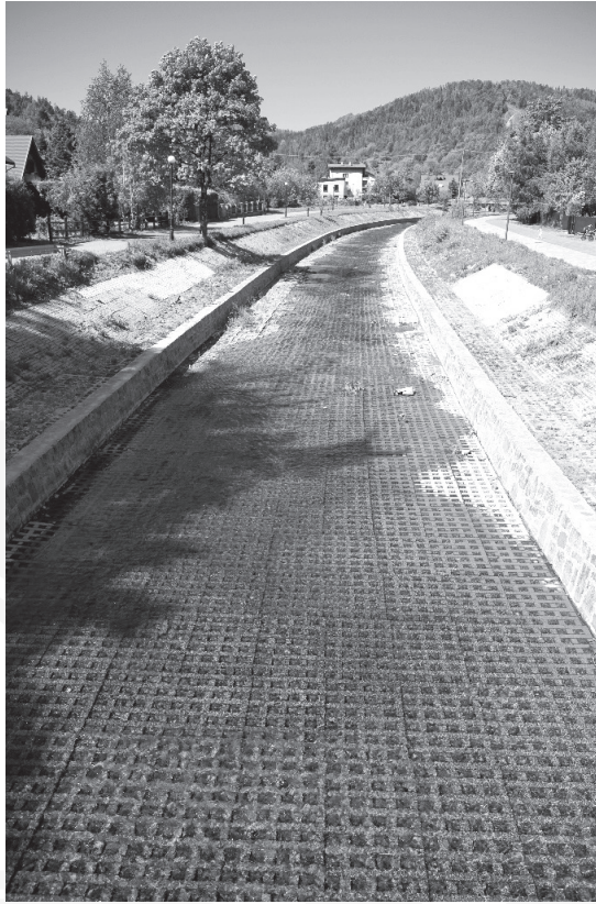
III. 8. The imposed industrial form