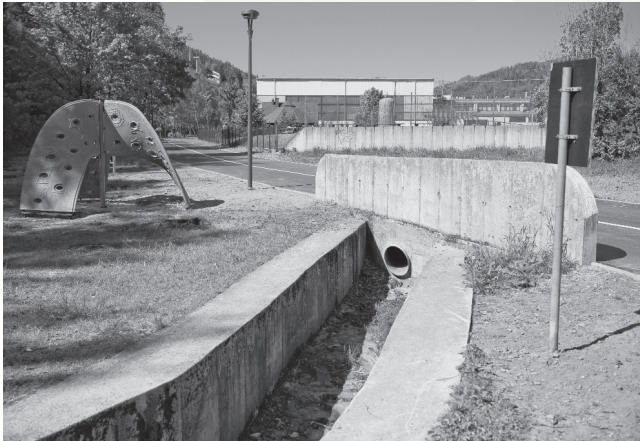
III. 5. Unprotected infrastructure elements next to a playground