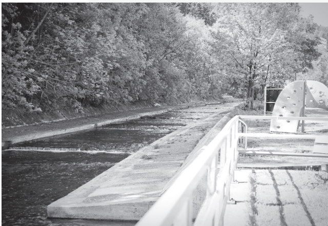
III. 6. The Žylica river banks lined with concrete – to the right: discernible a part of a playground