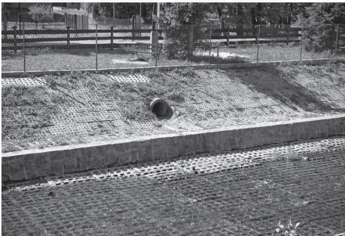
III. 9. One of the storm water drainage outlets