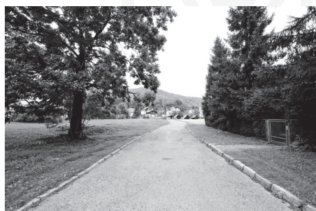
III. 2. The Promenade along the Żylica before transformation

New projects in public spaces do not always meet all the requirements of sustainable development. A good example is Szczyrk and its ‘Deptak nad Żylicą’ ( Promenade along the Żylica ), a street which stretches through nearly the whole town along the Żylica river 2 . In the past, it used to be a largely dilapidated area, yet in the years 2010–2011, the appearance of this precinct was changed completely. The ruined and uneven paving had been replaced so that the pedestrian and cycling route would promote recreation and transportation. It has considerably facilitated moving around the town and in consequence, the pedestrian and vehicle traffic has risen in volume. At present, a lot of residents use this alternative route around the town in fine weather. However, due to the aforementioned strongly linear layout of the town as well as to the scarce presence of services in the vicinity of the promenade, tourists tend to choose the main road, where most of the services are situated. There is also a system of parallel parking along the main road, which the promenade does not have. Therefore, at present the promenade remains a second-choice option.