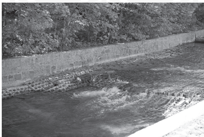
Ill. 7. Damages to the artificial riverbed bottom

the banks have been lined with concrete for more than a metre over the water surface with a very slight sloping angle. The above observation must lead to the conclusion that the land has been covered with hard surfacing without any reason – such actions do not increase the efficiency of the town's protection against flooding. A shallow basin with smooth surfaces, which impedes percolation of excess water during heavy rainfalls, only makes the situation worse by increasing the velocity of water flow. Thus, instead of protecting the town from flooding, it produces the exact opposite effect. In fact, nature has already verified the level of durability of several implemented solutions – in many places, the bottom has been damaged. The soil under the concrete slabs has been washed away, which has caused their collapse. The visual impression has greatly deteriorated due to this occurrence – it confirms that the maxim 'more is better' is not always the case. If the riverbed had been left in its natural state, such a situation would never have taken place, as it would have been shaped in the same manner all along its course. Moreover, even if there had been some points of damage, they would not have been so strikingly visible against the natural background, as is the case with artificial reinforcement.