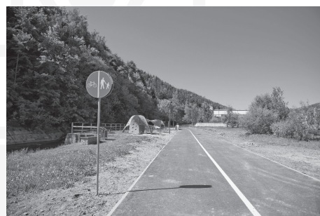
III. 3. The Promenade along the Żylica after the reconstruction (photo by the author, 2009)

There are some attempts at encouraging people to use the promenade, e.g. small playgrounds for children have been arranged in its vicinity. Yet, due to the very extensive transformation of the riverbed which was done while the river was being regulated, some of those areas are surrounded by a wall. There are also deep culverts and drainage canals which pose a real danger to children. The heights of those facilities are large enough for a child to suffer a limb fracture in the case of falling, not to mention some more serious injuries. The scale of the problem is large, because the riverbed has been turned into a concrete drainpipe, which has a permeable bottom only in certain sections, and this is only because concrete slabs of a grate structure have been used there. It has to be mentioned that in certain places,