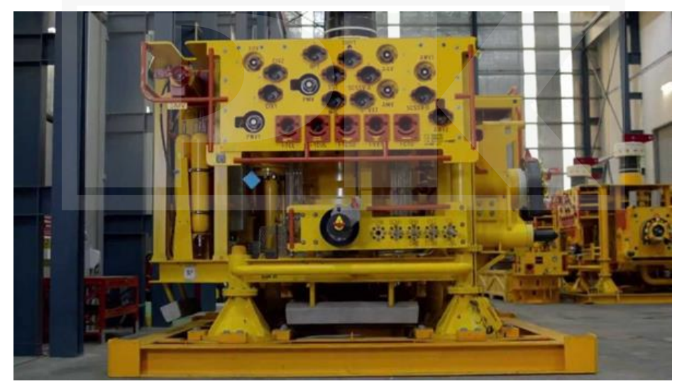
Fig. 1. Subsea Christmas Tree

The most important element in the subsea production system is the Christmas Tree (XT). The Christmas Tree is mounted on the wellhead at the seabed. The XT is a set of valves mounted on a specially designed steel block.