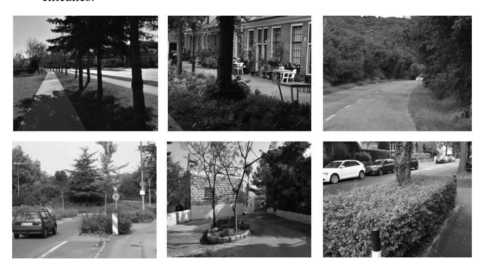
Fig. 2. Examples of greenery in roadside zones in selected countries Poland, Netherlands, Slovakia, Germany, Lebanon (line trees, shrubs belts, green roundabouts, green parking spaces)