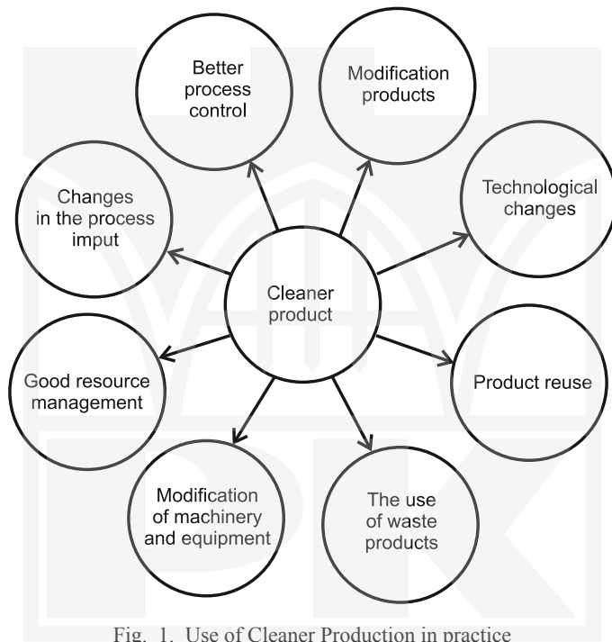
Fig. 1. Use of Cleaner Production in practice

Cleaner Production (CP) is a continuous use of processes and products integrated into a preventive environmental strategy to reduce the risk to humans and the environment. Cleaner Production uses a system which, when appropriate procedures are used, becomes a voluntary and not formalized environmental management system. UNEP defines Cleaner Production as follows: Cleaner Production is a strategy for environmental protection involving a continuous, integrated, preventive action in relation to processes, products and services, aimed at increasing the efficiency of production and services, and reduce the risk to humans and the environment [1]. Fig. 1 shows the use of Cleaner Production in practice.