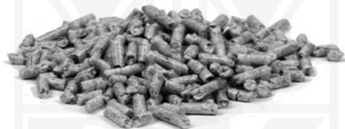
Fig. 2. Wood pellets with 6 mm in diameter

Wood pellets organic fuel is produced from the sawmill wood and intended for heat generation in boilers allocated to combustion of the pellets used to produce heat. Pellet can be used for heating purposes in houses, hotels, industrial buildings, warehouses, public buildings, and wherever there is a demand for heat. Fig. 2 shows wood pellets.