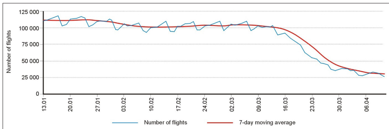
Fig. 2.. Number of commercial flights, including scheduled passenger, cargo, charter flights and some business flights.

The suspension of passenger flights in many regions of the world has led to a completely unusual situation in the history of aviation. The crowded airspace over many countries just a few months earlier now began to be almost empty. According to data from the Flightradar24 website showing the real-time location of aircraft on a map, the average number of commercial flights (calculated on a weekly basis) performed daily in the first week of April 2020 was 31,214, while in January 2020 it was still 110,000 ( https://www.flightradar24.com ) (Fig. 2).