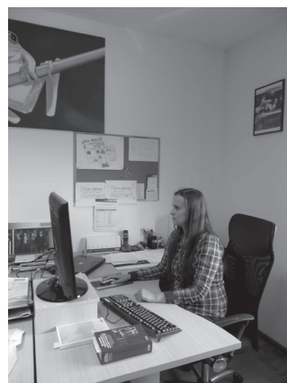
Fig. 16. Power Engineering commissioned course students at industrial traineeships with potential employers (MOTORTECH Polska) [2]

‘Contemporary Energy Technologies’ (the energy technologies of fossil fuels, the power engineering of renewable energy sources, the outline of nuclear power engineering) (Figs. 17–18).