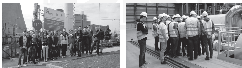
Fig. 6. The study visit at Elektrownia Łagisza (Łagisza Power Plant) in Będzin [2]

At the end of Semester 5, the students were given the subjects for the engineers’ dissertations, the defences of which are planned for January 2016.