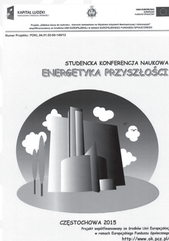
Fig. 17. The proceedings of the Student Scientific Conference Energetyka Przyszłości (The Power Engineering of the Future)

‘Contemporary Energy Technologies’ (the energy technologies of fossil fuels, the power engineering of renewable energy sources, the outline of nuclear power engineering) (Figs. 17–18).