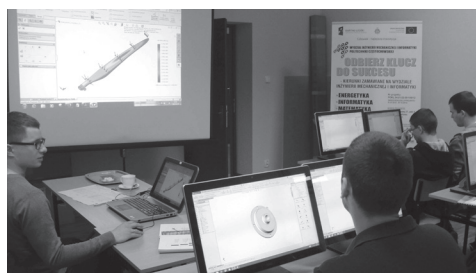
Fig. 14. Training in the CATIA and SOLIDWORKS software programs [2]