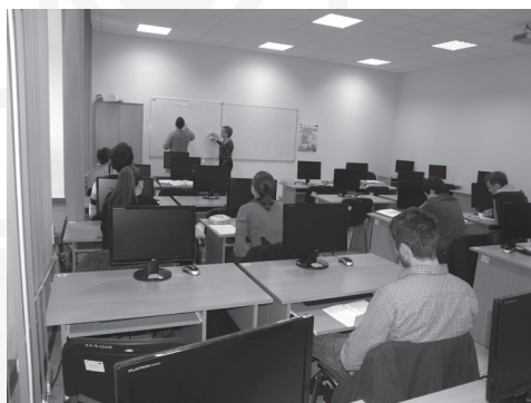
Fig. 2. Compensatory classes in physics and mathematics [2]