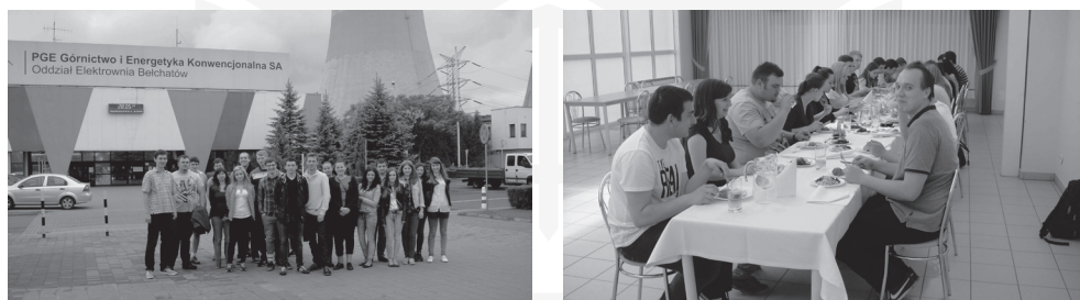
Fig. 5. The study visit at PGE Górnictwo i Energetyka Konwencjonalna (Mining and Conventional Power Engineering) in Belchatów [2]