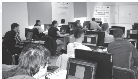
Fig. 13. Training in the AUTOCAD software program [2]