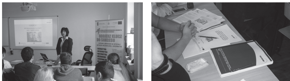
Fig. 15. The training course for the Internal Auditor of the Integrated Management System – ISO [2]