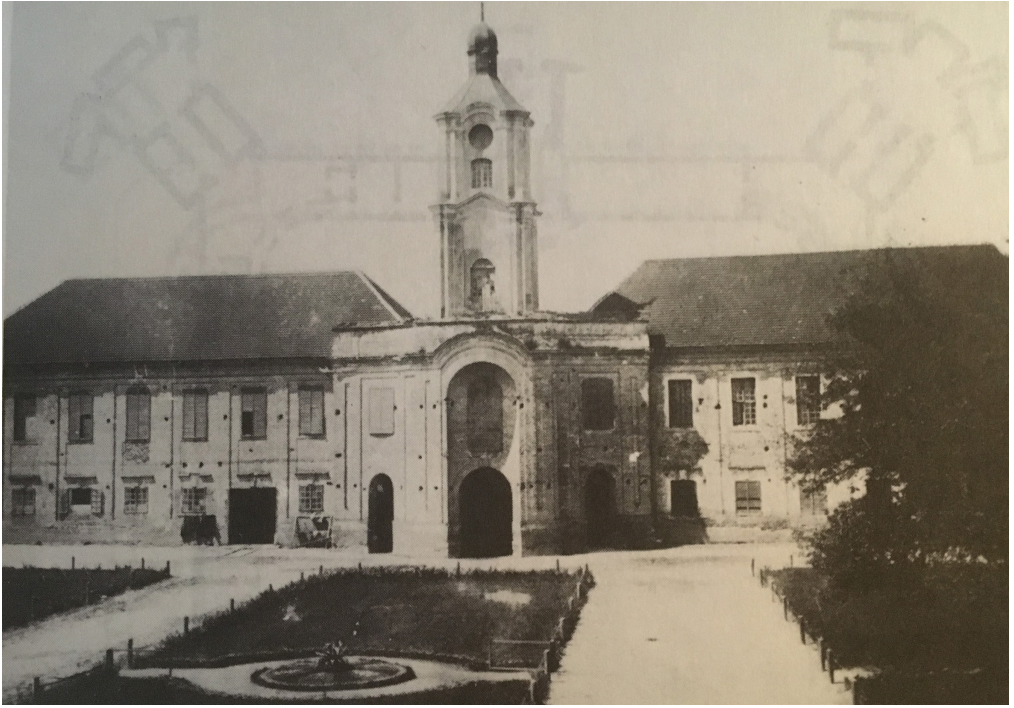
Fig. 3. Castle in Olyka, entrance gate facing the courtyard, before 1938 (source: [2])