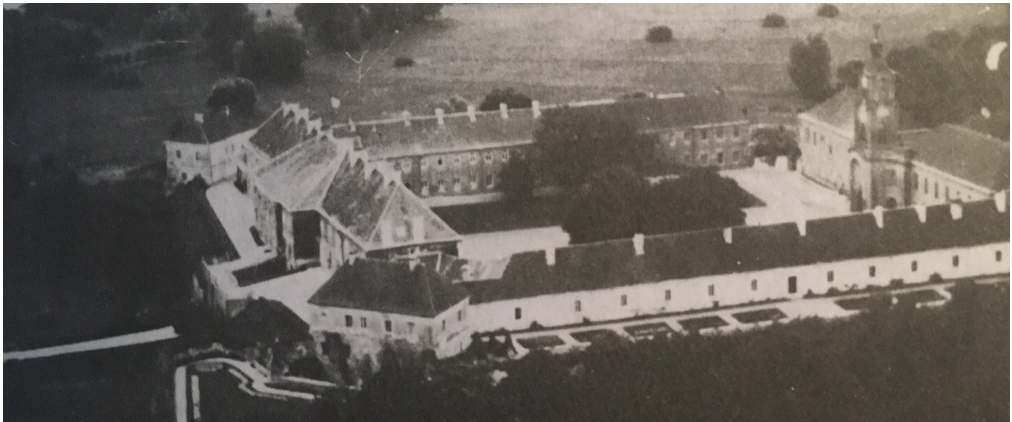
Fig. 2. Olyka, view of the castle in ca. 1914 (source: [2])