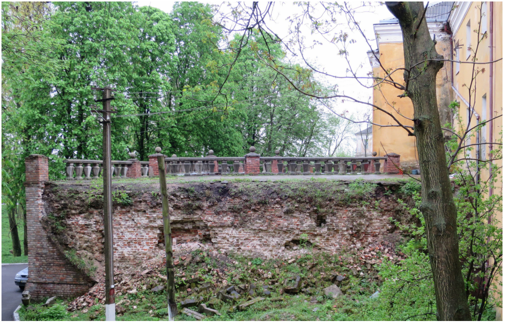
Fig. 7. Castle in Olyka, entrance gate facing the collegiate, condition as of 2019