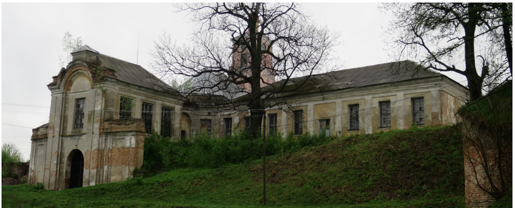
Fig. 8. Castle in Olyka, entrance gate facing Turczyn, condition as of 2019