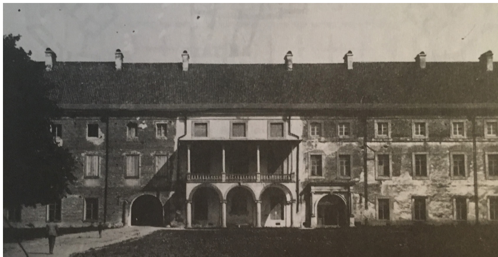
Fig. 5. Castle in Olyka, view of the wing of the palace facing the courtyard, 1939