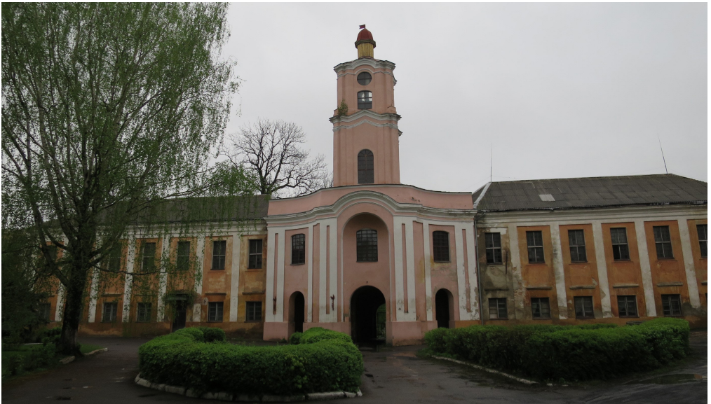
Fig. 4. Castle in Olyka, entrance gate, condition as of 2019