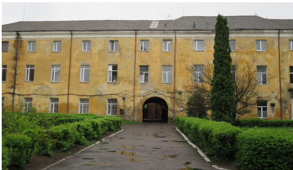
Fig. 6. Castle in Olyka, view of the wing of the palace facing the courtyard, condition as of 2019