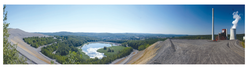
Fig. 11. View from the platform located at the end of the educational trail created in the area of the Göttelborn colliery on the slopes of the dumping site, a water reservoir and the local power plant set against the panorama of the region

sports lovers, and the slopes perform the function of public green areas in which camping is permitted. The southern slopes of the dumping grounds have also been used as the site of experimental vineyards, which apparently yield excellent fruit due to the soil, which is rich in carbon compounds.