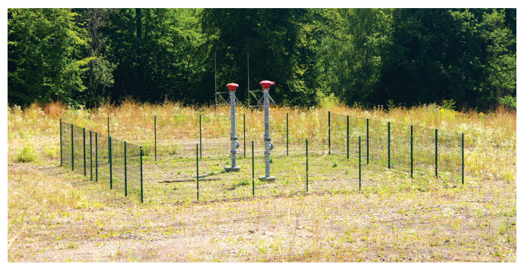
Fig. 3. An installation for degassing liquidated coal workings – the only element marking the former location of mining shaft Lauterbach on the border between Saarland and the Moselle district

existing headframes, which constitute characteristic dominant elements of the view. Remnants of liquidated collieries – in the form of abandoned and useless mining facilities – may be found both in Saarland, e.g. Elm shaft, Erkershöhe shaft in the vicinity of Friedrichstahl, Itzenplitz shafts near Schiffweiler or remnants of Landsweiler-Reden colliery (Fig. 4), and on the French side of the border: shafts in Stiring-Wendel, Saint-Charles 1 shaft between Grossrosseln and Petite-Rosselle, Troise shaft in L'Hôpital and others (Fig. 5).