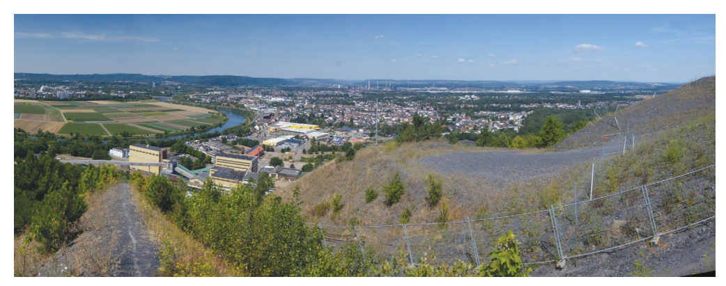
Fig. 12. View over the Saar valley and the city of Saarlouis – the capital of the Saar Basin – from the top of the dumping site heaped up at one of the shaft complexes of the Saar colliery, now in liquidation (photo by P. Langer, 2015)