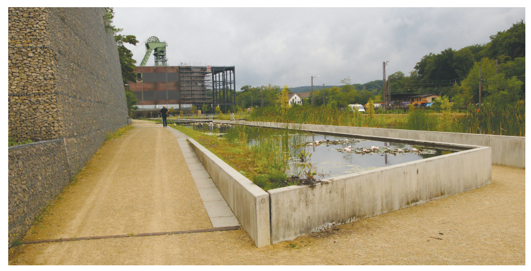
Fig. 8. Open areas of the revitalised colliery in Schiffweiler (Saarland, Germany) arranged as a contemporary park with a natural watercourse and an artificial water canal along the main compositional axis of the site