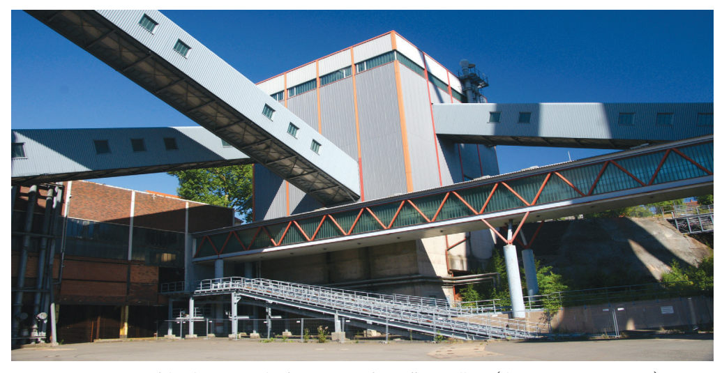
Fig. 10. Fragment of the aboveground infrastructure of Göttelborn colliery (the Saar Basin, Germany) now undergoing intensive spatial and functional transformation

Moselle region, which are currently going through the process of liquidation and are subject to intensive functional and spatial transformations. One of such collieries is Göttelborn , located a few kilometres to the west of Heusweiler (Fig. 10).