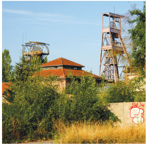
Fig. 5. Useless remnants of a colliery in Stiring-Wendel in the French district of Moselle (photo by P. Langer, 2015)