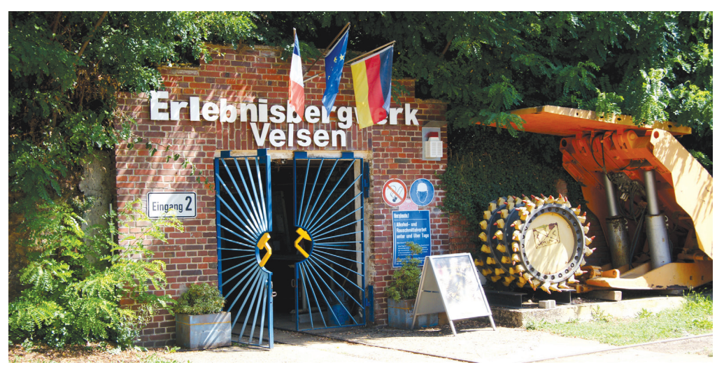
Fig. 2. Entrance to the underground tourist route created in a part of the former underground workings of the now defunct colliery Velsen in the vicinity of the German town of Grossrosseln (photo by P. Langer, 2015)