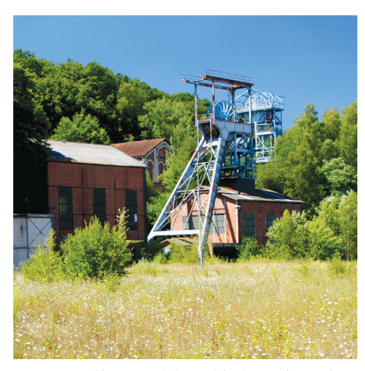
Fig. 4. Headframes and disused facilities of Itzenplitz shafts in the Saar Basin

existing headframes, which constitute characteristic dominant elements of the view. Remnants of liquidated collieries – in the form of abandoned and useless mining facilities – may be found both in Saarland, e.g. Elm shaft, Erkershöhe shaft in the vicinity of Friedrichstahl, Itzenplitz shafts near Schiffweiler or remnants of Landsweiler-Reden colliery (Fig. 4), and on the French side of the border: shafts in Stiring-Wendel, Saint-Charles 1 shaft between Grossrosseln and Petite-Rosselle, Troise shaft in L'Hôpital and others (Fig. 5).