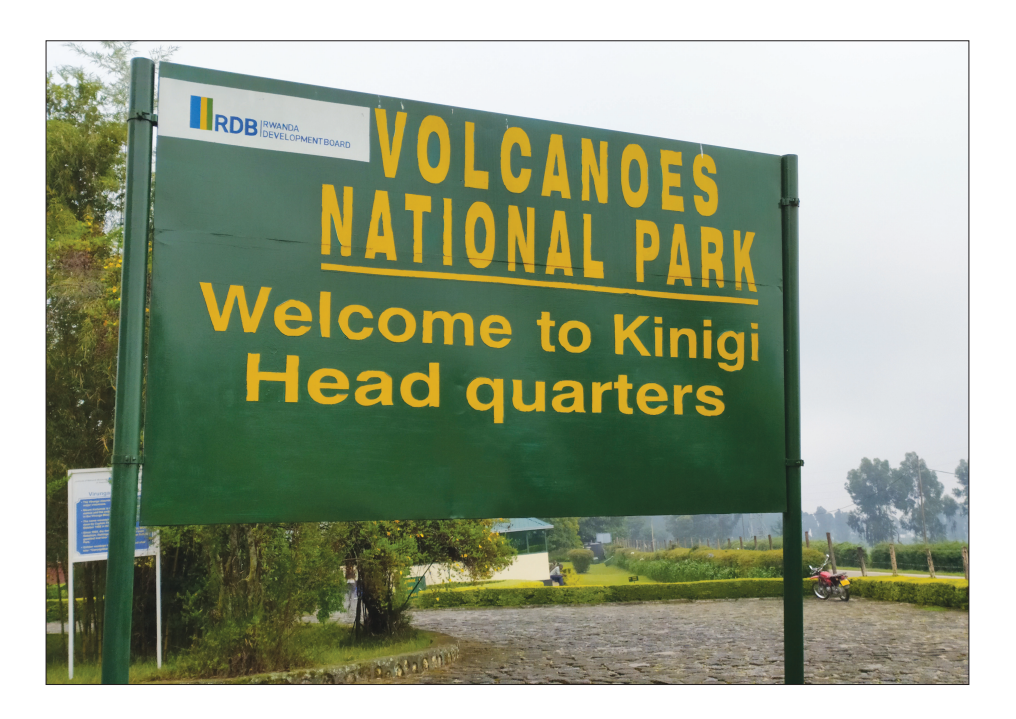
Photo 1. Volcanoes National Park - entrance