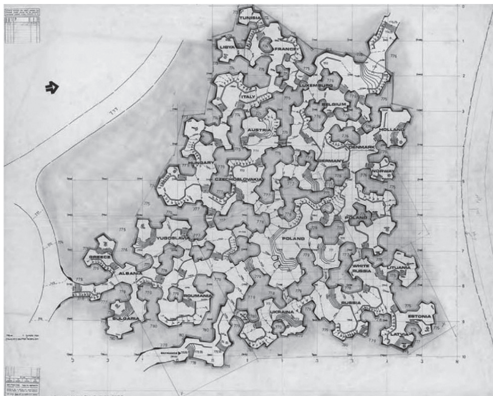
III. 1. Valley of the Destroyed Communities, geographical organisation of the names of the communities

This labyrinth is located at the western edge of the Yad Vashem complex – it was designed by Lipa Yahalom and Dan Tzur at the beginning of the 1980s. The structure is made up of over one hundred sections which are separated from each other by walls of Jerusalem stone. The aerial view shows an open maze depicting a world that has disappeared. The form commemorates the Jewish communities from Europe and North Africa – these communities were exterminated during the holocaust. The experience of wandering through the site evokes confusion, separation, solitude and brings reflections on life and death. The names of the communities are carved on the rocks and the labyrinth represents their location on the world map [9, p. 87]. Walking through the labyrinth of high walls makes the visitors feel small and surrounded by the enormity of the destroyed world. This structure both commemorates and awakens the history of a people who have lived in Europe for more than one thousand years and are trying to preserve their identity.