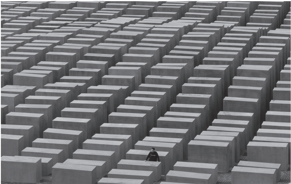
Ill. 4. Peter Eisenman, Memorial to the Murdered Jews of Europe, Berlin

In 1998, the second competition for the Memorial to the Murdered Jews of Europe in Berlin was won by the American duo, Peter Eisenman and Richard Serra – their submission was selected during a public debate on the project. At the request of the German Chancellor, the project had to be modified, taking into account the creation of the underground museum, which eventually formed the information centre [10, p. 4]. Eventually, Peter Eisenman created a labyrinth of high stone blocks. It is reminiscent of the concept of Jewish cemeteries, where coffins were arranged one above the other because of the lack of space. However, the designer himself interpreted his concept differently, which did not show such clear Jewish symbols but more the approach to a multi-dimensional maze [7, p. 157]. The artist wanted to see a man entering the monument and losing his sense of security. He mentioned the feeling of loneliness which every human being faces in dangerous situations. The designer wanted to show the universal message which referred not only to the fate of the Jews.