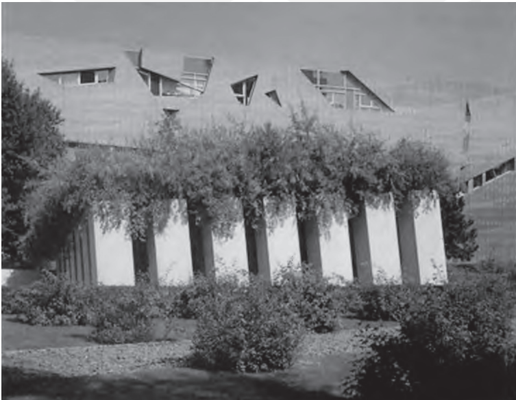
Fig. 2. Jewish Museum in Berlin. New Wing. The Garden of Exile.

The interpretation of the labyrinth was used also in the Garden of Exile as a part of the Jewish Museum in Berlin created in 1989. The structure, designed by Daniel Libeskind, lies at the end of the Axis of Emigration and it is composed of forty-nine concrete columns filled with vegetation. The similarity to the stalls in Yad Vashem creates the sense of a strong association with the Jewish Community.