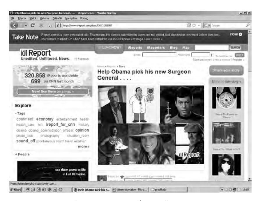
Fig. 5. www.iReport.com/docs/DOC-250957, 27th September 2009