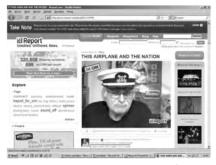
Fig. 3. Dimmit's commentary (www.iReport.com/docs/DOC-219776, 15th September 2009)