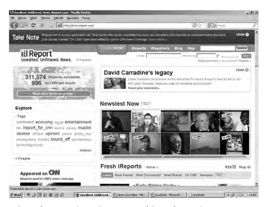
Fig. 1. iReport home page (www.iReport.com, 20th September 2009)

Ziomek J. 1990. Retoryka opisowa. Wrocław.