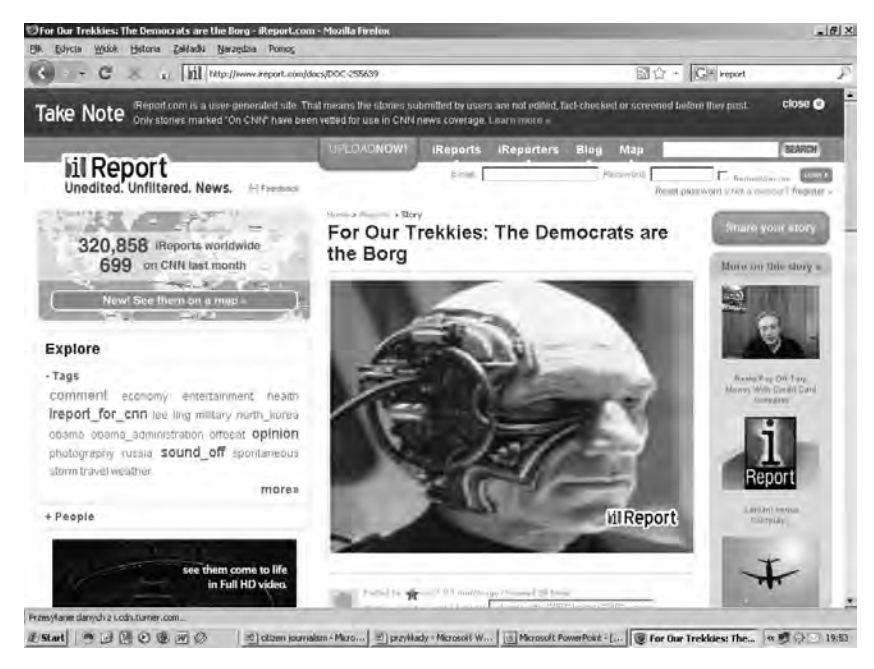
Fig. 6. www.iReport.com/docs/DOC-255639, 28th September 2009