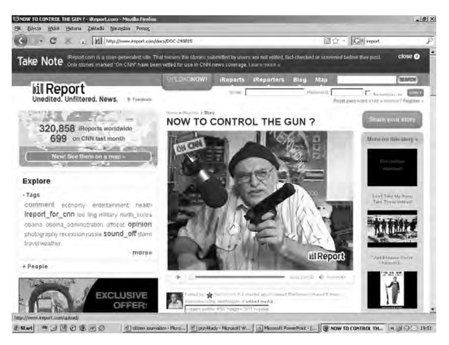
Fig. 4. Dimmit's commentary (www.iReport.com/docs/DOC-240815, 15th September 2009)