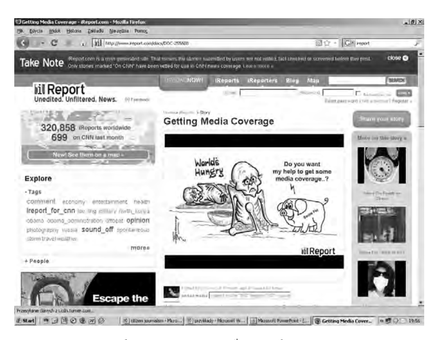
Fig. 9. www.iReport.com/docs/DOC-255608, 27th September 2009