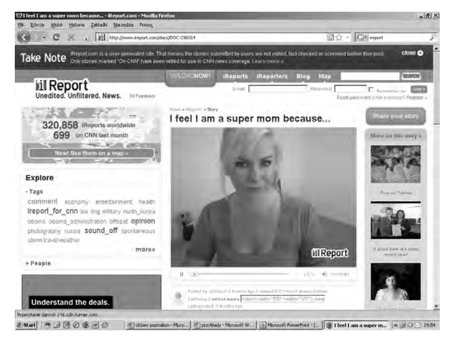
Fig. 2. OCGirl's commentary (www.iReport.com/docs/DOC-236314, 22<sup>nd</sup> September 2009)